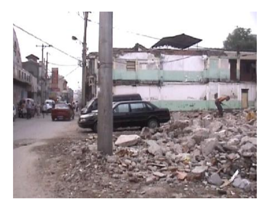
Illustration 7 : Hutong in Meishi Street : screenshot, 00:05:43 (Ou, 2006. Used with permission)

Both films used the image of Hutong . Beijing's Hutong is an important city symbol which illustrates the life changes of Beijing's residents. In Charming Beijing , as a heritage of urban landscape, the image of Hutong appears for only about 20