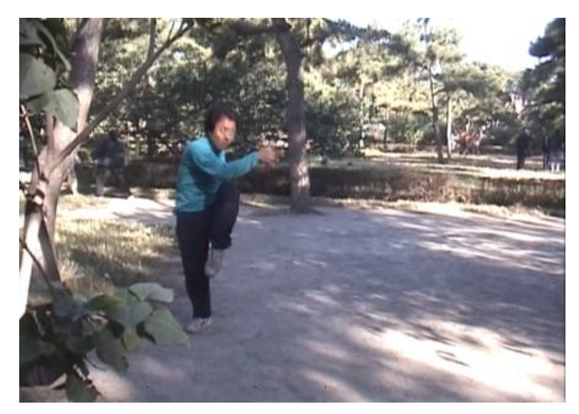
Illustration 10 : Kung Fu in Meishi Street : screenshot, 00:11:49 (Ou, 2006. Used with permission)

Meishi Street also uses images of morning exercises but the connotations are quite different.