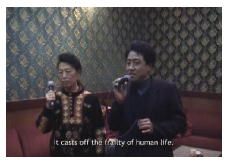
Illustration 12 : Urban culture in Meishi Street : screenshot, 00:56:36 (Ou, 2006. Used with permission)

Castells (1977) refers to "urban culture" as "a certain system of values, norms, and social relations possessing a historical specificity and its own logic of organization and transformation" (p.74). The urban culture demonstrated in Charming