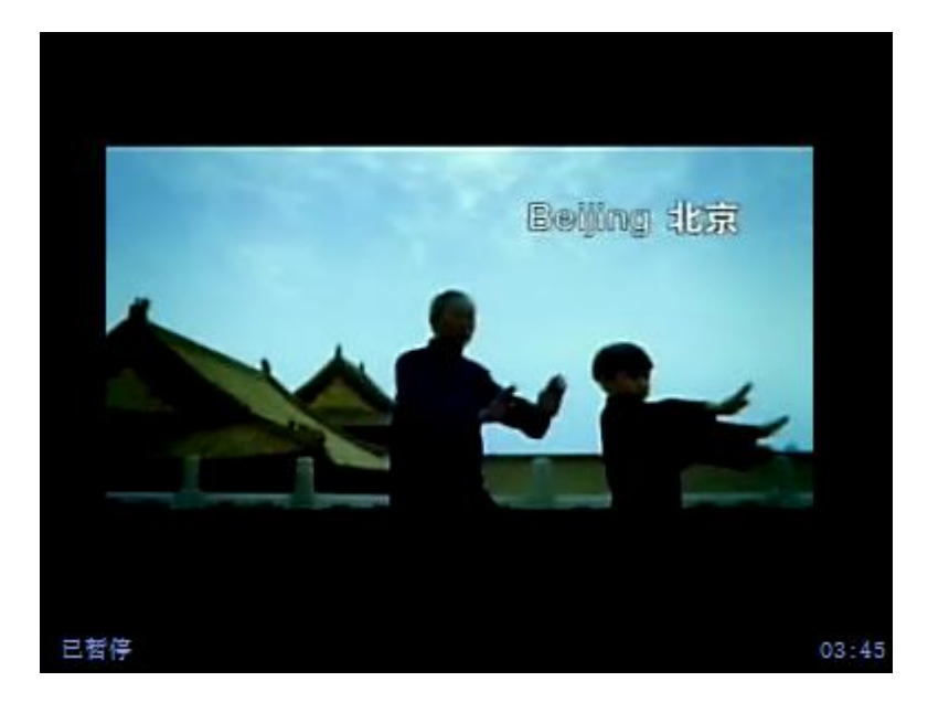
Illustration 9 : Tai Chi Quan in Charming Beijing: screenshot, 03:45 (BOCOG,n.d.)

The first is an image of the sport of flying a kite. Normally, flying kites should happen on the grassland or in a big open square, but in the above image, the elderly man is flying a kite among skyscrapers, a forest of steel and concrete, which is not a very common occurrence. The elderly person is not just flying a kite, he is flying the hope of Chinese society. Arguably the combination of the image is far-fetched. This is similar to the second image in which an elderly person and a child, dressed in traditional robes—rather than the everyday clothes most people wear while exercising—are shown practicing the traditional sport of Tai Chi Quan in the front of the Forbidden City<sup>7</sup>. Images of the elderly appeared frequently in Charming Beijing . To some extent, the elderly symbolize Beijing's long history and culture, especially in the film where such images were often tied up with traditional cultural forms such as kites, painting, calligraphy, and so on. Arguably, the two images are symbolic and