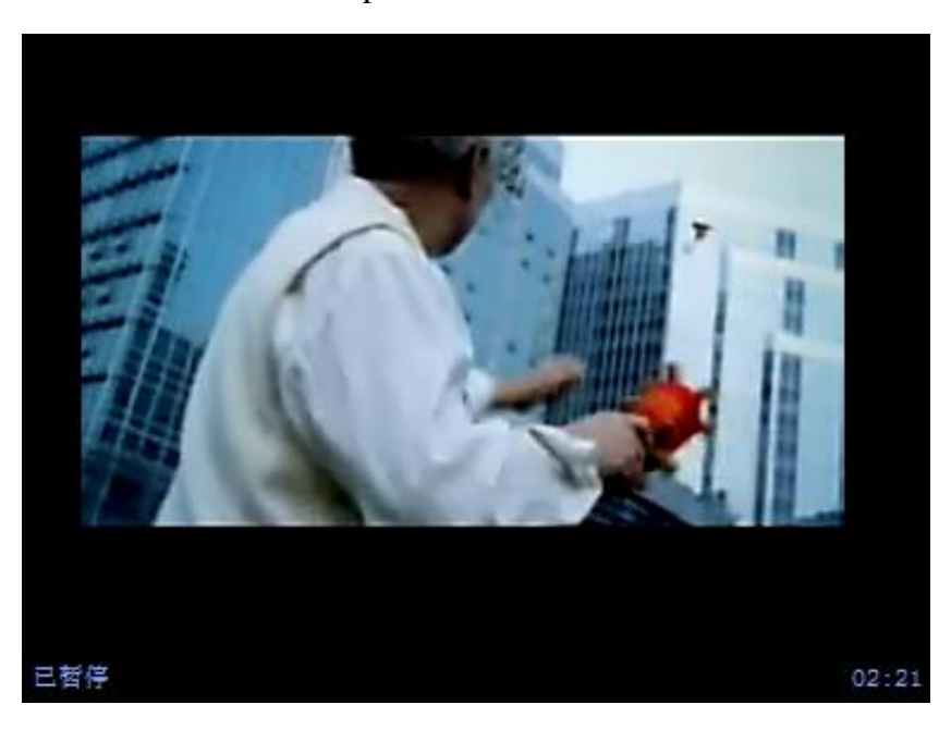
Illustration 8 : Flying a kite in Charming Beijing: screenshot, 02:21 (BOCOG, n.d.)

As a promotional film, Charming Beijing shows many Chinese traditional sports such as shuttlecocks, kites, bicycling, and Tai Chi Quan . In contrast, Meishi Street shows some popular mass sports in peoples' daily life such as climbing and boxing. Compared to Meishi Street , the sports represented in Charming Beijing are like performances rather than real sports.