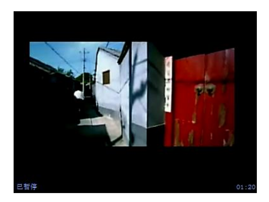
Illustration 6 : Hutong in Charming Beijing: screenshot, 01:20 (BOCOG, n.d.)