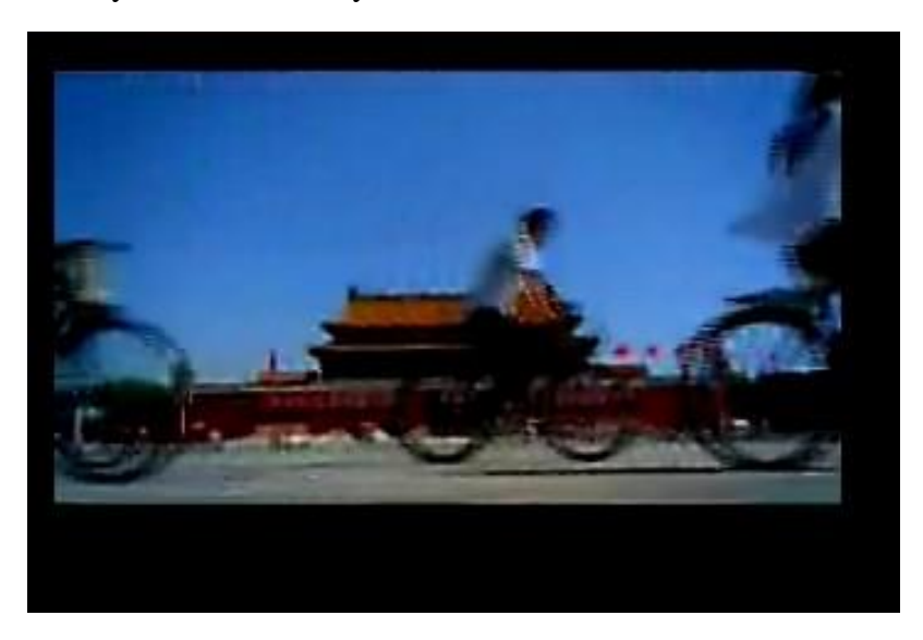
Illustration 2: Tiananmen square in Charming Beijing: screenshot, 02:04 (BOCOG,

As the capital of China, Beijing contains a number of political symbols such as Tiananmen <sup>5</sup>Square and Zhongnanhai .<sup>6</sup> How do we read the following pictures, in Barthes' term—myth; what is its myth? And how does it function?