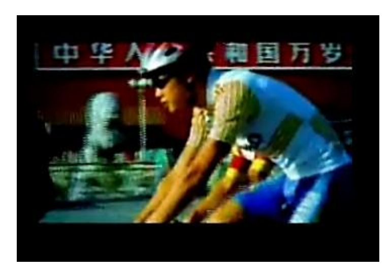
Illustration 3: Tiananmen Square in Charming Beijing: Screenshot, 03:29 (BOCOG,