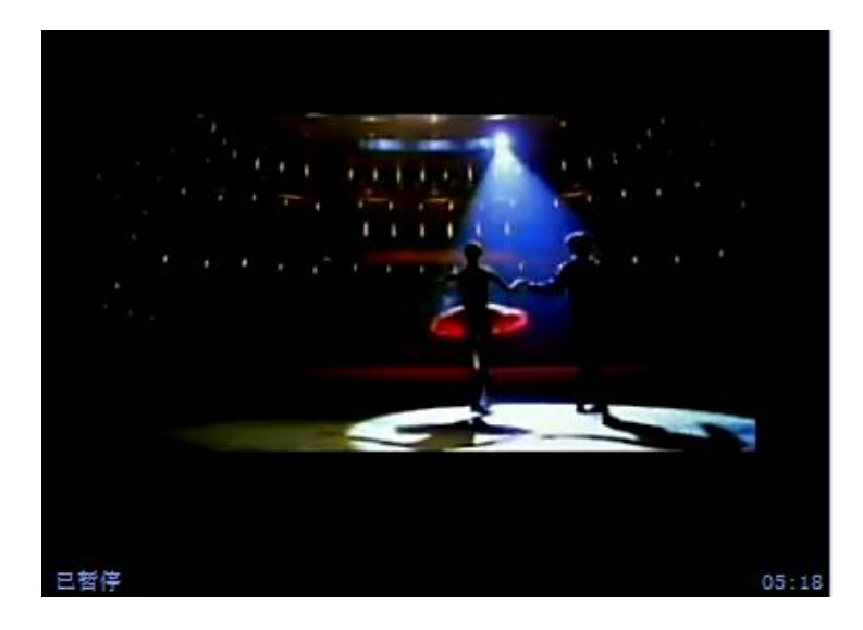
Illustration 11: Urban culture in Charming Beijing: screenshot, 05:18 (BOCOG, n.d.)