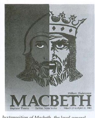
Juxtaposition of Macbeth, the loyal general, with Macbeth, the visciously evil king (Joseph McDonald)

This Macbeth poster is a result of an experiment by Hanno H.J. Ehses in which the heuristic possibilities of ten style figures are tried out. Students in a design class were asked to find graphic encodings for a poster that announces this Shakespearian drama, using the construction principle of a specific rhetorical figure as a guideline. The signification process in visual design moves along two major lines, Ehses explains: