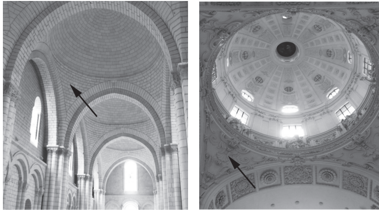
Figure 1. On the left, an unadorned series of domes sit on top of arched supports in Fontevraud Abbey, France. The arrow indicates a pendentive. Without decoration, the secondarily required pendentives impose no decorative constraints upon the dome. On the right, both the pendentives and the dome within the Theatinerkirche, Munich are heavily ornamented—the arrangement of decorations and windows must resonate with the pendentives.

adaptationist programme” Gould and Lewontin (1979) examined the reductionist view and methodology of gene- and trait-centered approaches to evolution. Organisms, they argued, should be regarded as integrated wholes. Within their paradigm, organisms are viewed as embedded in a historical baggage of ancestrally derived genes, networks, morphologies, and processes. This baggage constrains the latitude for innovation of new structures. The spandrels (or more accurately pendentives) in the title of their article are not themselves initially a primary architectural feature: they are the accidental consequence of other architectural decisions. Like a round peg on top of a square hole, the primary decision to place a dome on top of a squared array of arches leaves a gap that must be filled at the corners. Pendentives embody the “filler,” but they eventually end up limiting the options available to decorate the dome. For example, it would look silly to have 3, 5, 6, 7, or 9 angels and disciples arrayed on a dome that is supported by four pendentives decorated at the corners (Fig. 1). In their critique, Gould and Lewontin (1979) allude to spandrels/pendentives to make the case that biologists might sometimes mistake an