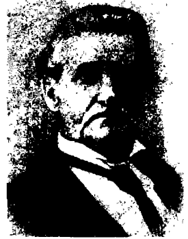
Walter P. Lane