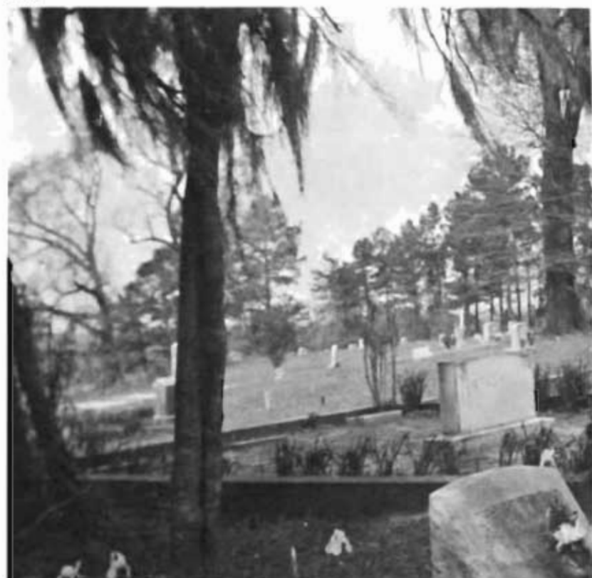
A small part of the Shelbyville cemetery. To the immediate left of the picture is the highway as it dips sharply to cross the Tenaha bridge—now a smaller iron one.