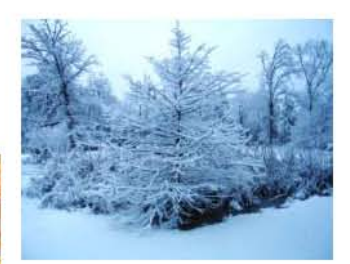
With the quiet slumber of winter, a rare snowy blanket is a magical sight to behold.