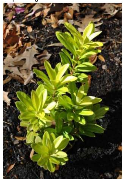
Illicium parviflorum 'Florida Sunshine'

To anchor the area, there is a border of one of our more compact Satsuki azaleas, Rhododendron "Fujimori." If you ever wanted a perfectly rounded, never-needspruning, pink blooming shrub, 'Fujimori' is the answer. The Japanese have been breeding and selecting Satsuki hybrids for more than 500 years, and most within the group are late flowering and compact in nature. This description fits "Fujimori" to a T. And of course, the pink flowers fit with our theme.