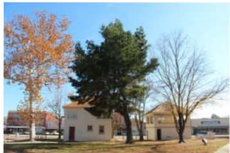
Spruce pine planted at the Shelby County Courthouse

The image here is of a spruce pine planted in the landscape of the Shelby County courthouse in Center, Texas. This landscape was established in 1988 as a contract job with the SFA Horticulture Club and the City of Center. This was a wonderful ex-