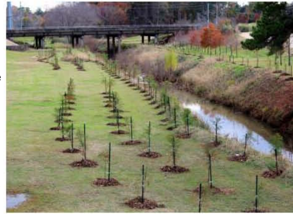
A view of the bald cypress SMZ along LaNana Creek

The bald cypress are staked with a steel t-