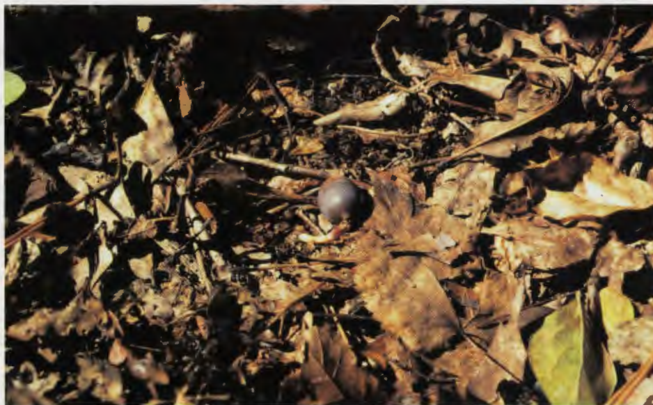
Newly germinated acorn.