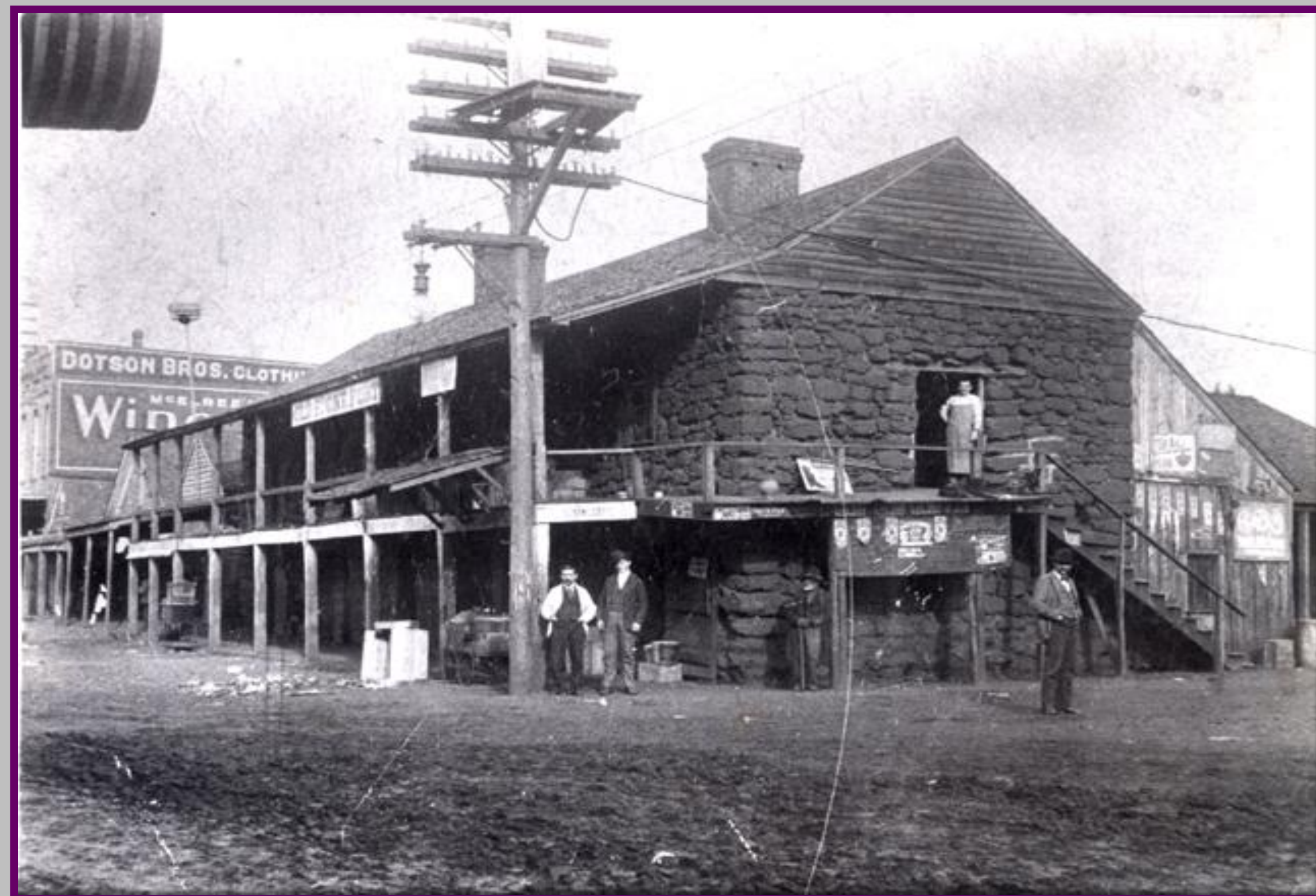
The first Nacogdoches County courthouse was the Old Stone Fort. This vernacular structure built in 1779 was also known as La Casa Piedra due to the Spanish rule over Texas which would continue for the next thirty years. It is easy to see the Spanish influence evident in the architecture of the Stone Fort; walls "made of brick similar to that used in the adobe houses of Spaniards".