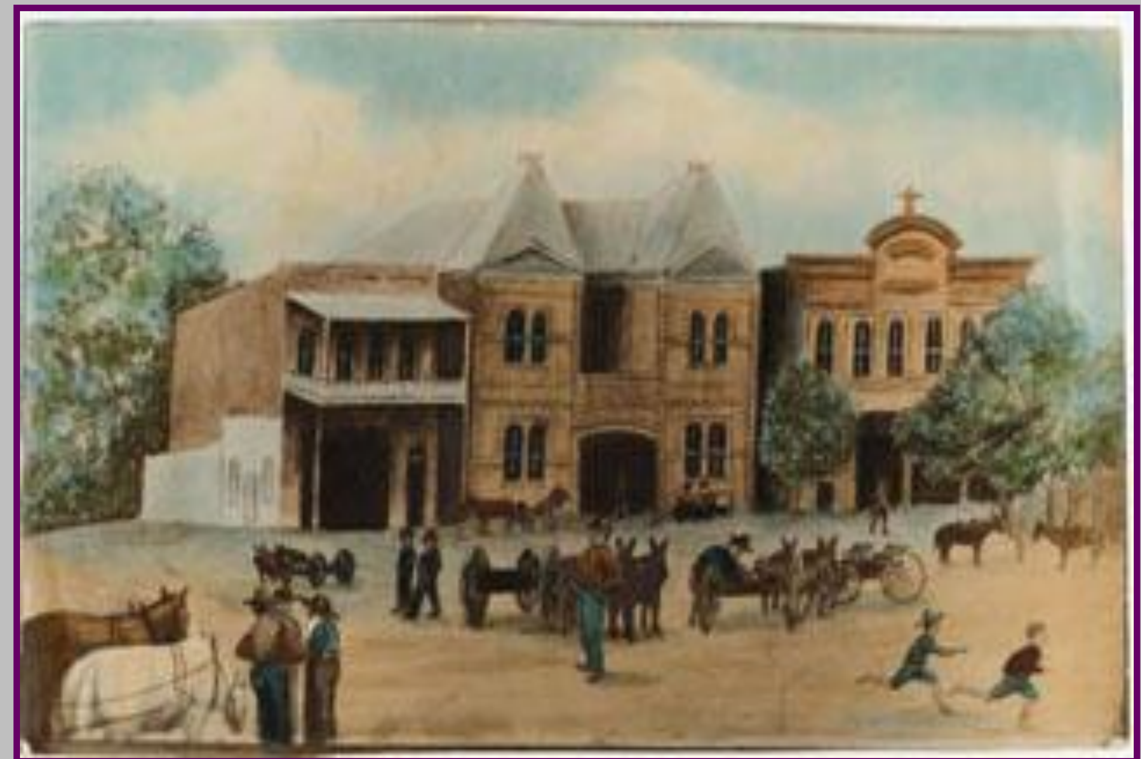
To better suit the town and its people a new courthouse was built downtown. This courthouse as seen in George Crockett's sketch was a clear depiction of Gothic architecture and Second Empire Baroque as seen by the unique roof shape with iron work at the top. After a fire almost destroyed the west end of downtown it was proposed that a new courthouse be built on the south side. Painting of the Third Courthouse. George, Crockett.