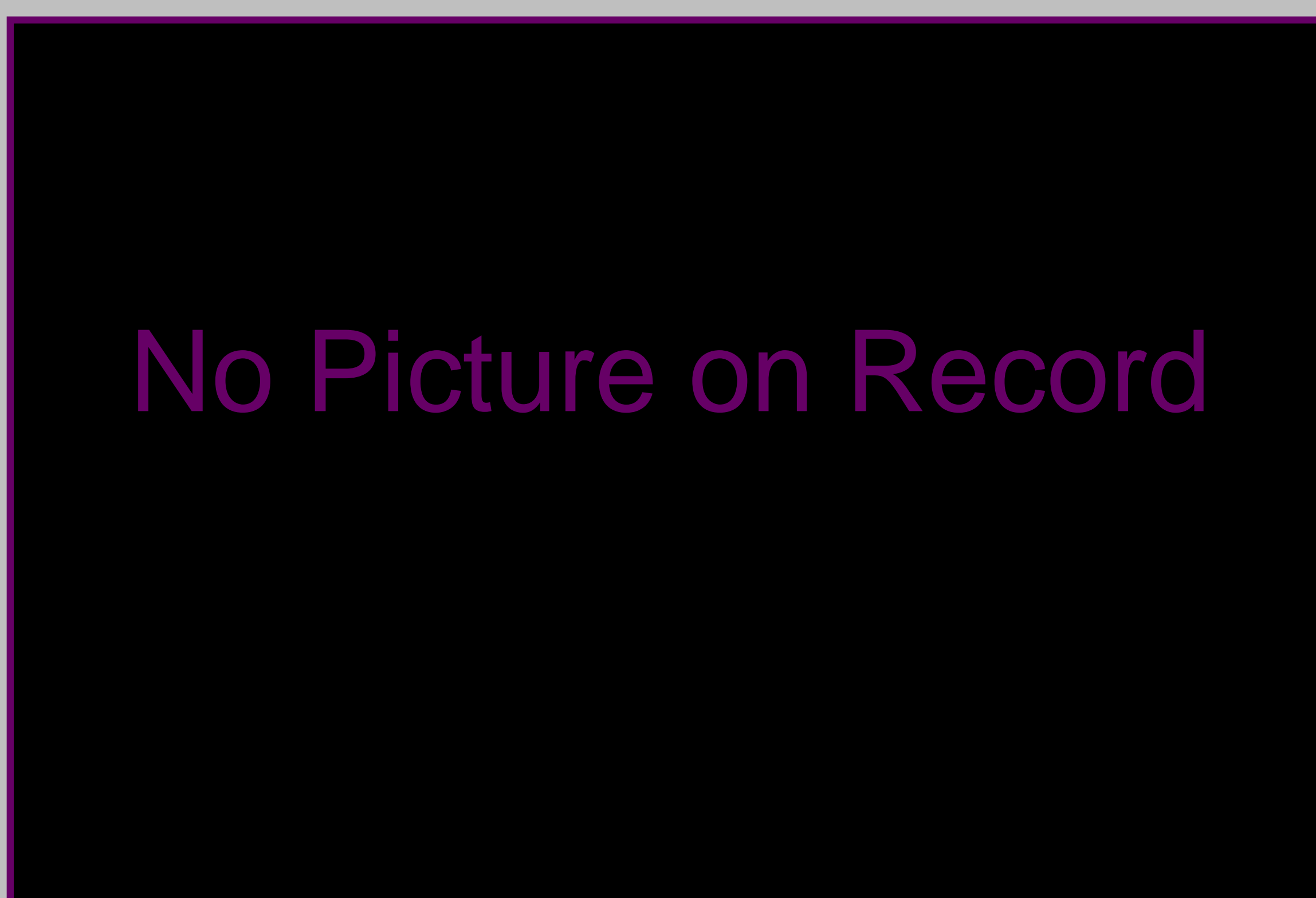
The County's next courthouse, utilized between 1840 and 1827, was a vernacular wooden structure. This courthouse did not last long on account of poor conditions which led to frequent recesses from the court.