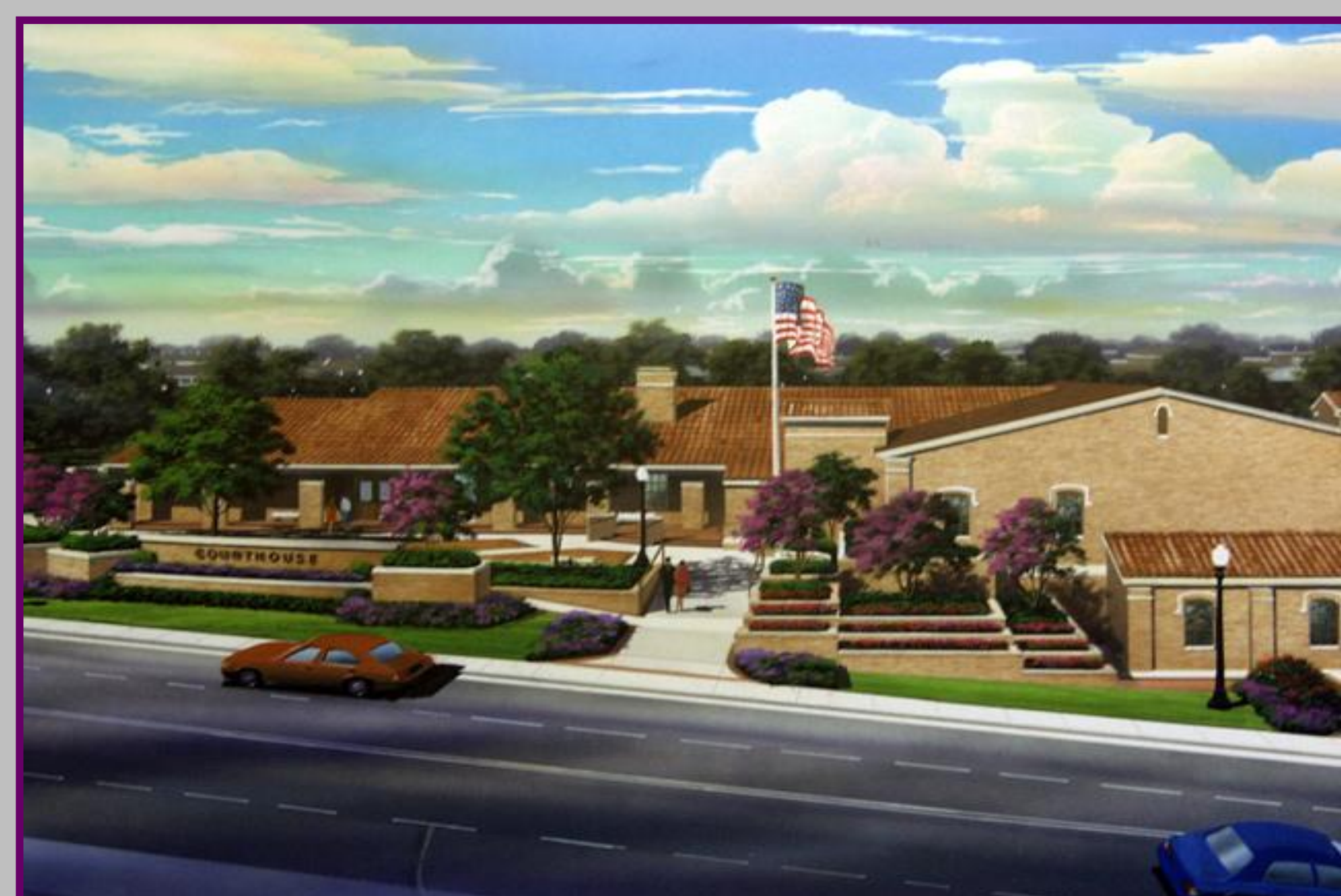
This final courthouse was built in 1960. The most noticeable element of the courthouse is the red tile roof, a great reflection of the Spanish Eclectic style popular between 1915 and 1940. Another aspect of the Spanish Eclectic style is the asymmetrical build to the building which can be seen in the placement of windows and archways. There is also greater emphasis upon this style as seen by the narrow archways towards the entrance of the building. The only elements that do not appear to fit with the Spanish style of architecture are the wider archways and casement windows located on the side of the building and under the red tiled shed roof. These arches show off more of an Italianate style that was popular between 1840 and 1845. The casement windows, a window style popular during the 17 th century, act as a replica of this original style thus bringing a sense of formality to the building.