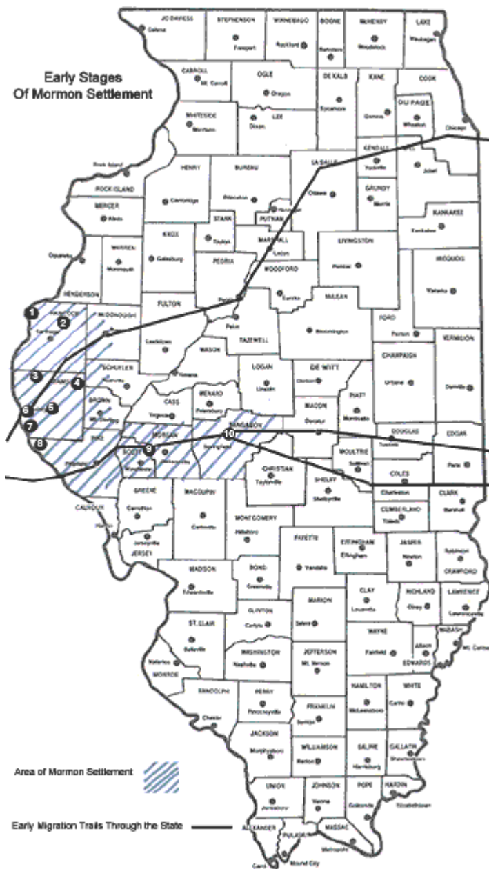
Map Showing Areas of Mormon migration routes and Mormon Settlement Prior to 1841

Kirtland echoes this earlier sentiment to scatter. Smith's letter went on to say, "we further suggest for the considerations of the Council, that there be no organization of large bodies upon common stock principles, in property, or of large companies of firms, until the Lord shall signify it . . . ." His letter goes on to warn of the dangers of gathering for the saints. 29