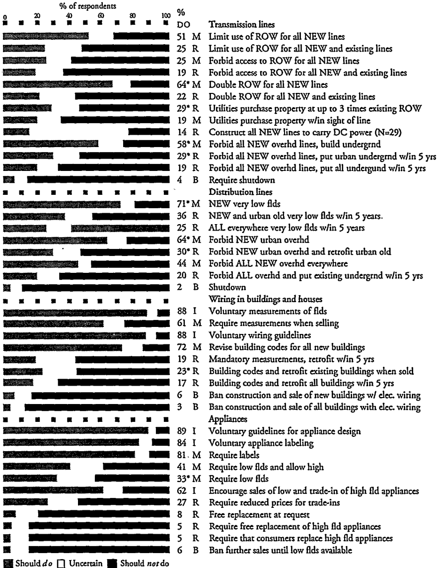
Figure 3 4 Responses to field-exposure reduction and elimination options