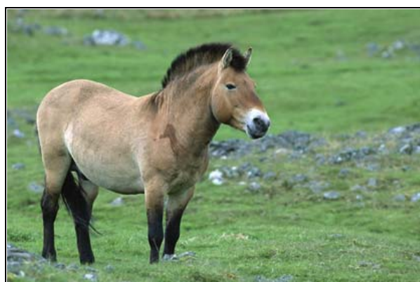
Figure 1. Przewalski's horse ( Equus przewalskii , also known as Mongolian ass, Asian wild horse, Mongolian wild horse, and takhi) is the last remaining true wild horse. Several reintroduced herds survive in Mongolia.

Originally domesticated 5,000 to 6,000 years ago, wild horse populations once roamed much of the Eurasian steppes (Petersen et al., 2013a, 2013b; Warmuth et al., 2011). E/SE Asian indigenous horses are repositories of valuable genetic diversity. Numerous traits have been exploited to develop many of the world's 500 unique breeds. Founding horse populations contained a wealth of genetic diversity. However, because of artificial selection and loss of most of the wild populations, this pool of diversity is disappearing (McCue et al., 2012),