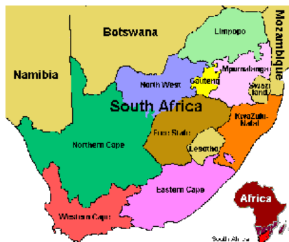
map of South Africa

I appreciate the support of a Center for International Education travel grant that helped me return to East London, in the Eastern Cape of South Africa in February 2014. This was my fourth trip to South Africa since 2011. All four trips have been in conjunction with South Africa Partners, a Boston-based NGO celebrating its 15 th year of supporting collaborative health and education initiatives in South Africa. http://www.sapartners.org/