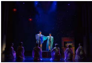
Scenes from the production

working relationship with Singapore theatre artists, with whom I am looking forward to future project collaborations.