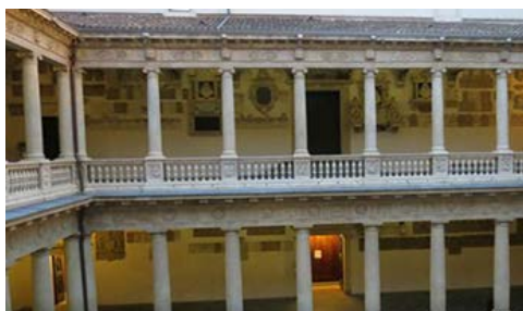
Patio at the University of Padova