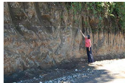
Studying the soil profile in Chile

This trip allowed me to develop research and education collaborations, look for potential sites for future research and a field course, and the time to pursue my scholarship in a beautiful environment. I would like to thank CIE for their support in making this opportunity possible.