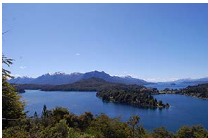
Parque Nacional Nahuel Huapi in Argentina

Patagonia is a vast landscape of grasslands, shrub-steppe ecosystems, glaciers, and ancient forests. To see these ecosystems first hand, I took a 20-hour bus trip from Buenos Aires west to Bariloche, located in the foothills of the Andes. From there, I visited several national parks, where I explored the vegetation and soils of the region. From a research and teaching perspective, I am particularly interested in the ecosystems in this part of the world, because they are at the same latitude (except in the southern hemisphere) as my primary research sites here in the Northeastern U.S. and so represent an interesting contrast in terms of climate, soils and vegetation. Trip highlights included a visit to Parque Nacional Nahuel Huapi; the Valdivian rainforest in Parque Nacional Los Alerces, home of the ancient alerce trees; and a trip across the Andes, following an ancient Native American trade route.