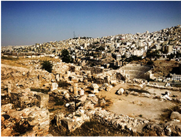
Citadel Hill overlooking the Roman Amphitheatre in Amman, Jordan

the vast sleepy Texas suburban town that I grew up in – sprawling, concrete, inorganic, and very new. But also a welcome respite from the chaos of Cairo. After arriving in Jordan, a back-up IROP destination I had picked just two days earlier, I spent a few days on a buddy’s couch before I received word that I would be staying in Amman for the remainder of the summer as conditions had only worsened in Egypt. Thus began the Herculean task of finding a new mentor in order to pick up my research, no small feat given that all my six months of research preparation had been on Egypt.