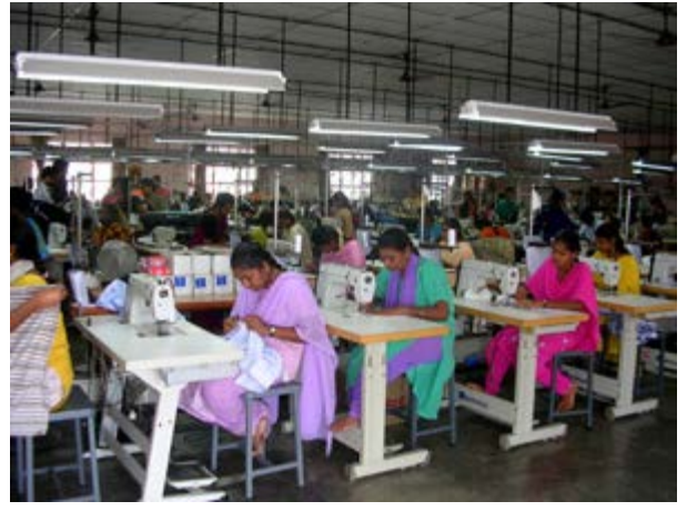
Indian women sewing the clothes at the Lakshimi Textile Mill

The conference and faculty development program were superb. Conference presenters came from around the world, but primarily from all over India. I met faculty with similar research interests with whom I will now collaborate. I also learned a great deal about Indian culture from our gracious hosts and from the Indian business students who guided me from session to session and made sure I showed up on time (no small task). The faculty development program was a key highlight. We all, including the session leaders, faculty from around the world, and business leaders from Bangalore and Coimbatore, talked day and night for three days about issues related to globalization and human resources. We visited workers in textile plants in and around Coimbatore, and together we ate fabulous local food served on banana leaves. Already my students have benefitted from the examples and stories I am now able to share.