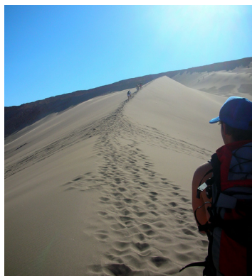
A view of Chile's Atacama Desert

Retaining your sanity on a bus in South America is no small feat, and the twenty-seven-hour bus ride from Valparaíso, Chile, to the Atacama Desert was no exception. Clandestine passengers, livestock, and traveling bands playing their tunes all night long made for an unforgettable ride. Needless to say, once in the tiny town of Atacama, I was ready for some rest and relaxation in the quiet desert of Chile's northwest corner. I would get no such thing.