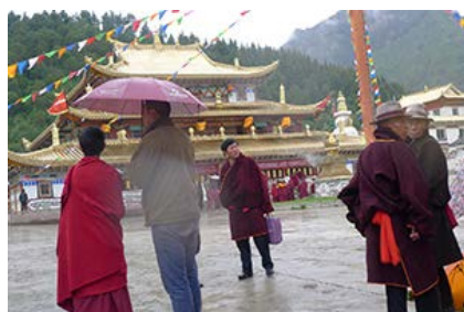
Tibetan Monastery in Sichuan