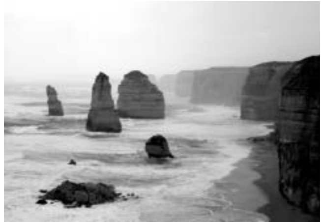
Emily Loughlin’s winning picture, taken on a windy and rainy day, is of “The Twelve Apostles,” a rock formation in Port Campbell National Park in Victoria, Australia.