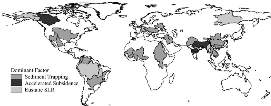
Fig. 3 Dominant factor determining the estimate of baseline ESLR for each of the 40 deltas. Sediment trapping is the dominant factor for 27 deltas, eustatic sea-level rise is most important for eight deltas and accelerated subsidence predominates in five deltas. This assessment identifies the major factor at play under contemporary baseline conditions .