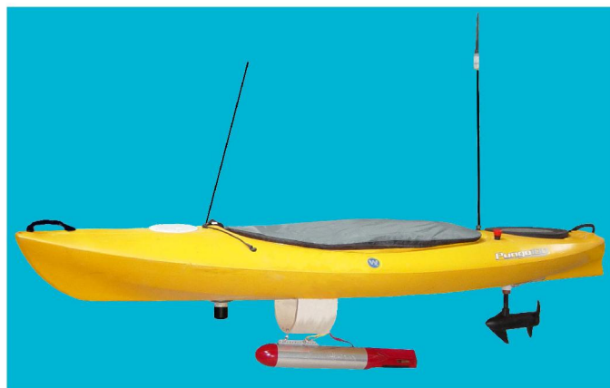
Figure 1. ASC SCOUT Vehicle outfitted with acoustic modem, side scan sonar, GPS, RF communications hardware, wireless Ethernet.

Recently developed station keeping autonomous buoy platforms may be particularly useful for situations where rapid buoy platform deployment is required [1],[2]. Other justifications for self-positioning buoys include increased mobility of these platforms, dynamic network capability (i.e. the ability to interact with each other in response to ambient conditions or directives), and reducing deployment and maintenance costs.