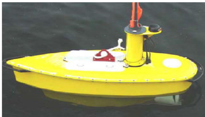
Figure 2. NUWC Station keeping buoy.

Deployment of multiple un-tethered self-positioning vessels in conjunction with traditional moored buoys may offer another potentially useful operational scenario. Moored buoys offer certain advantages over their un-tethered counterparts, including: the ability to ride out rough weather with minimal expended energy, larger power storage capacity, reliable communications to and from land-based stations, and the elimination of sophisticated navigation and control software. These advantages weigh in against drawbacks including: fabrication and maintenance costs, deployment costs, limited effective sensor range, and the potential for entanglement and/or loss due to weather and collisions. However, let us consider a hybrid approach whereby we deploy a single moored buoy which can dock with multiple low-cost highly mobile vehicles with position-keeping capabilities. The docking buoy could provide adequate power for recharging the mobile assets, act as a relay station with increased power for increased wireless range, and permit the potentially more vulnerable mobile assets to dock and maintain position during inclement weather without expending significant energy.