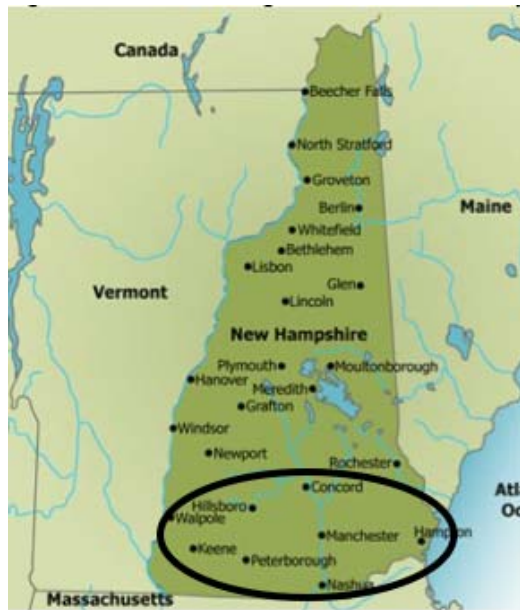
Fig. 1: Map of New Hampshire that highlights the region characterized as southern New Hampshire.

I began my study by looking for southern New Hampshire natives whose speech would be an accurate sample of the southern New Hampshire dialect. They had to have lived in southern New Hampshire for their entire lives or since early childhood, and could not have lived anywhere else for a significant amount of time. (See Fig. 1) I found participants in places where I grew up, such as local schools, churches, and other community settings. I was also able to find speakers in Riverwoods, the retirement community in Exeter. The wide age range in my participants allowed me to look at differences between older and younger speakers. I later split the participants into two groups for data analysis: the fifteen speakers younger than sixty (referred to here as “younger speakers”) and the twelve speakers older than sixty (referred to as “older speakers”).