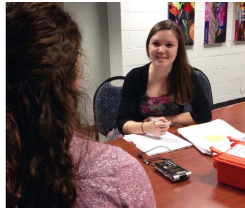
The author records an interview with a younger southern NH speaker.