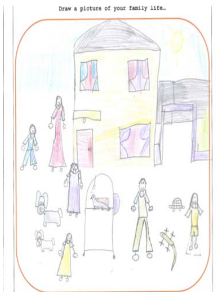
Figure 2: The pictures above illustrate the variability of drawings obtained when children were asked the same questions.

The statistics suggest that children with depressive symptoms drew more separate families and sad faces, while non-depressed children drew more mothers, siblings, and family portraits. We also found that the depressed group more frequently illustrated stepparents and self-portraits. Interestingly, a higher percentage of children in the depressed group used color. (See Figure 2)