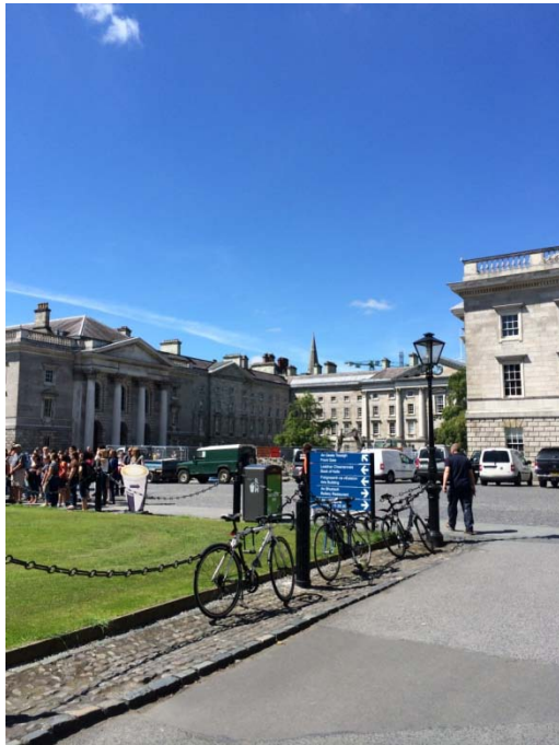
The Trinity College Campus located in the heart of Dublin.

The schools chosen to be included in the HSP were in Tallaght West, a section of Dublin considered to be socially and economically deprived with above average crime rates. It has high unemployment rates, high numbers of local authority housing projects, and many social problems (Axford, Little, Duffy, Haran, & Zappone, 2004). A 2002 report by the Childhood Development Initiative and the Dartington Social Research Unit states that one in ten residents were unemployed, and one in three was a single-parent household. Both of these statistics were twice the national average (Axford et al., 2004).