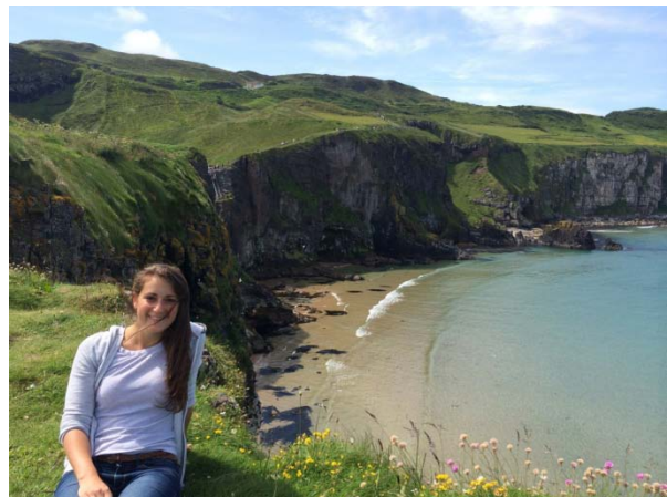
The author at the Carrick-a-Rede Rope Bridge in Northern Ireland.

As a senior nursing student at the University of New Hampshire, and as a person who is always asking "Why?" constantly digging for more information, I have always had a dual passion for helping those in need as well as finding answers to those "Why?" questions. I grew up knowing that one day I would travel the world. While at UNH, I discovered a program that would allow me to combine the three things that drive me: caring for others, conducting research, and travelling. With a Summer Undergraduate Research Fellowship (SURF) Abroad grant from the Hamel Center for Undergraduate Research, I spent nine weeks in summer 2014 at Trinity College in Dublin, Ireland. There, I conducted visual content analysis of children's drawings in an effort to understand the connection between depression and how children portray family life. I was challenged on a daily basis, conducting literature reviews, analyzing data, and researching visual content analysis.