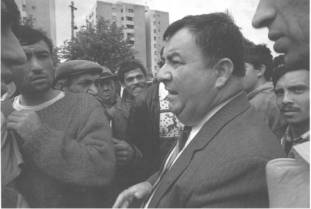
Gypsy candidate campaigning for senatorial elections in Romania, 1990.

have had notably different experiences with law. It is clear that claiming rights is one aspect of liberal democracy that finds fertile ground in the newly 'liberalized' populations. We can see some variation in commitment to rights if we look at instances of claims to social rights in which the claimant is specified, however. The commitment decreases in all countries when questions are asked about rights to a job for excluded groups. Table 2 compares responses to the item from the rights consciousness scale that asks about 'right to a job' with the three items from the excluded groups scale that ask the same question specifying foreigners, women or gypsies (minorities in the United States). Commitment to the right to a job for excluded groups clearly weakens in all countries, in some cases precipitously, except when the recipient is a woman. This finding indicates that rights entitlement is devalued when the claimant is perceived to be outside the normal group.