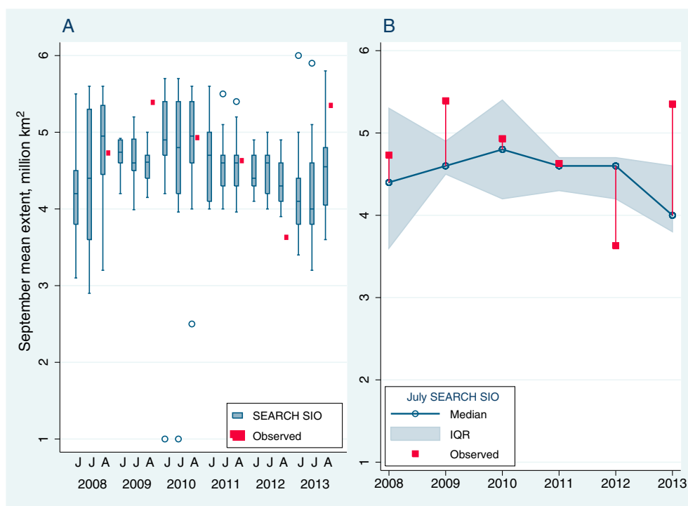
Figure 1. (a) SEARCH Sea Ice Outlook predictions for June, July, and August reports compared with the observed mean September ice extent, 2008–2013. (b) Median and interquartile range of the July SIO predictions compared with the observed mean September extent.