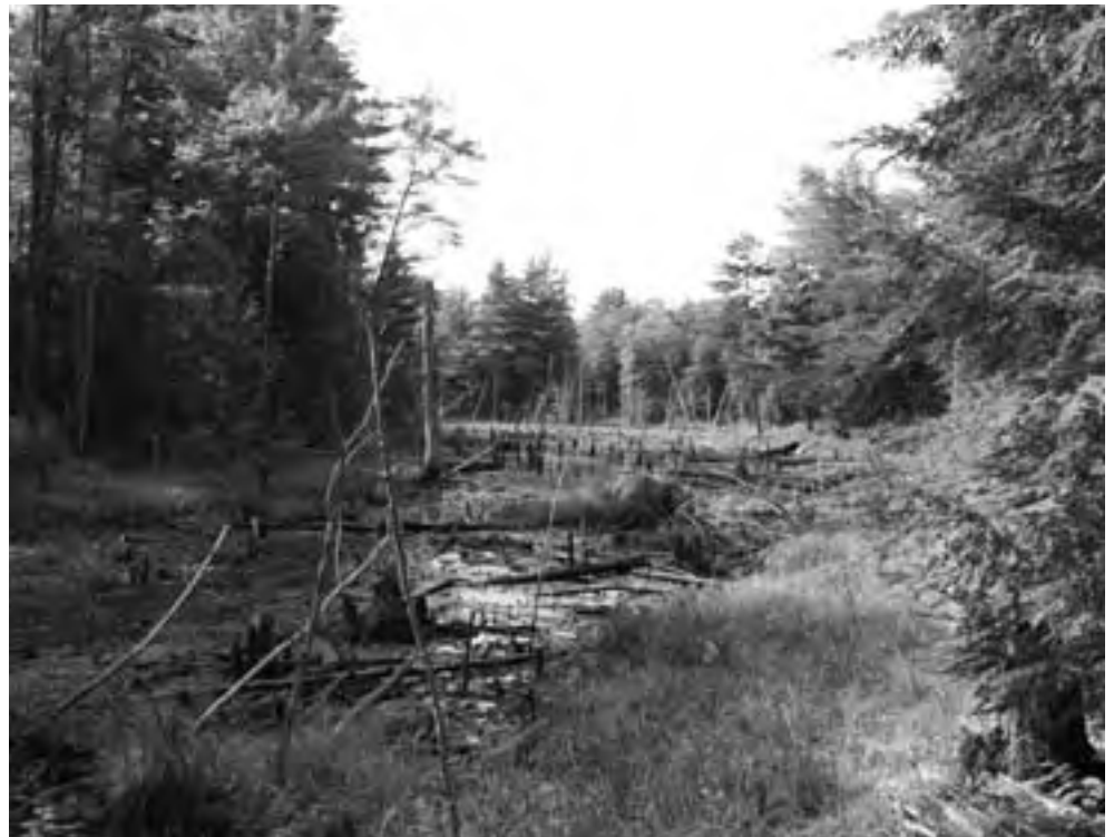
This wetland created by an abandoned beaver dam is just one example of a wide variety of habitats found on the project properties.

The Isinglass River property is located within a Conservation Focus Area identified in the Land Conservation Plan for New