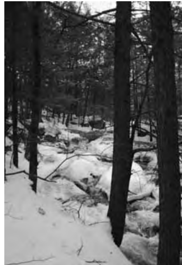
The Isinglass River slips among snow covered boulders – over one mile of frontage will be protected.

In order to receive the CELCP grant, the project partners need to “match” that federal funding with an equivalent amount of local or state support. Fortunately, the match can be made up through the appraised value of other land conserved as well as other cash contributed to the project. Three local private property owners have agreed to donate conservation easements and/or land to the Town of Strafford and