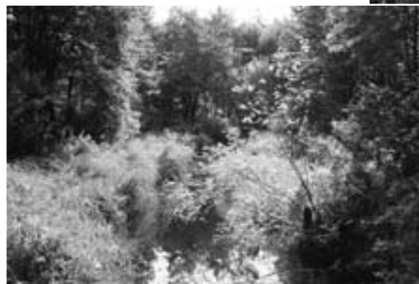
The 158-acre Cooper-Walworth easement includes 2,600 feet of frontage along both sides of "Buzzy Run", a tributary of Bow Lake and the Isinglass River, and 4,263 feet on Province Road and Wild Goose Pond Road. A conservation easement on the property was donated to the Town of Strafford and Bear-Paw.