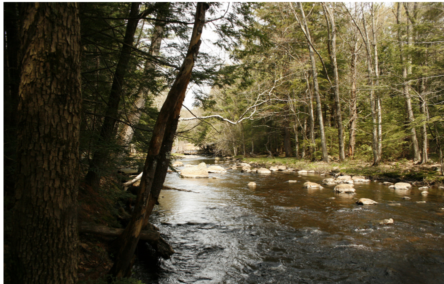
Isinglass River, Strafford, New Hampshire

five properties totaling 868 acres in Strafford. The land is located in the Upper Isinglass River and Blue Hills Conservation Focus Areas as identified in The Land Conservation Plan for New Hampshire’s Coastal Watersheds . The focal point of the initiative, a 287-acre parcel containing approximately 1.5 miles of frontage on the Isinglass River, was purchased with the help of a $1.3 million grant from the Coastal and Estuarine Land Conservation Program. Three local landowners and the Strafford School Board generously donated property in fee or easement to increase the total conserved area threefold.