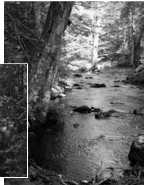
The 79-acre Bedford property includes 1,180 feet of frontage along the Isinglass River and 874 feet on Ricky Nelson Road. The property was donated to the Town of Strafford with a conservation easement held by Bear-Paw.