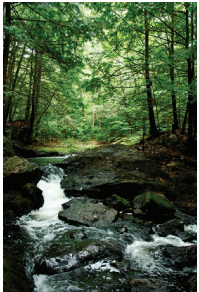
View of Isinglass River Conservation Reserve.