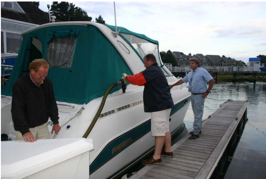
Figure 3 Pump out boat demonstration

Appropriate hand outs about boat pump out locations and use were provided and distributed by participating agencies.