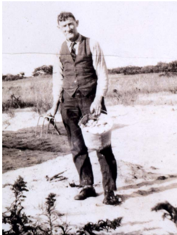
Figure 4 Seabrook resident clamming in Seabrook Harbor 1916

As in previous years, GBCW volunteers have provided not only a valuable source of manpower for NHDES Shellfish Program personnel but have also proved themselves to be an exceptional conduit for information. While working at their sampling sites or in their communities, GBCW volunteers have ample opportunity to converse with neighbors and visitors about the work they are engaged in. These conversations provided the impetus behind the Estuarine Education Series