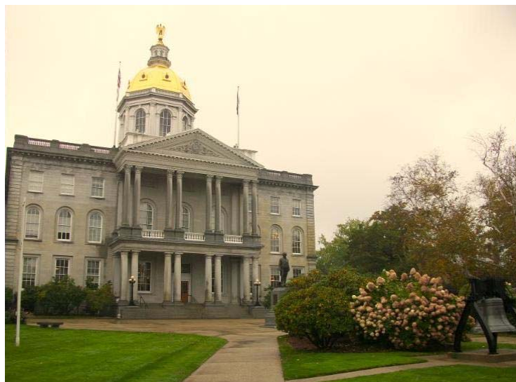
The New Hampshire State House on a cloudy summer afternoon. The legislative and executive branches of government meet here, but the judicial branch has its own building on the other side of town.

was fading and if New Hampshire was destined to return to the era of court-clearing—of a Supreme Court embroiled in the realm of politics. I stepped outside of the law school into a dreary, drizzly Concord. The sun, invisible behind the thick gray clouds, was setting. Carefully sidestepping the deep puddles that checkered the sidewalks, I began my walk back to the car, and it was not long before I reached the State House lawn. Since I first set foot on that lawn during a fourth-grade field trip, the edifice has always seemed to command me to stop for a moment and stare, perhaps out of respect for its simple grandeur or for the history that has been made within its walls. As always, my feet obeyed. The golden dome forced my eyes upward, but I soon tore them away to look across the street at the State Library. I smiled at the irony of the Supreme Court moving back into the shadow of the State House to escape the shadow of court-clearing, that old specter that has chased it down through the centuries. Although I cannot guess what the future has in store for the New Hampshire Supreme Court, my summer research has convinced me that the events of the nineteenth century are as important to understanding it as the politics of the twenty-first century.