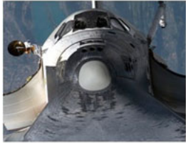
Heat shield at bottom of Space Shuttles