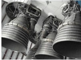
Motor exhaust nozzles for Space Shuttles