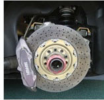
Brake pads and rotors for high performance vehicles