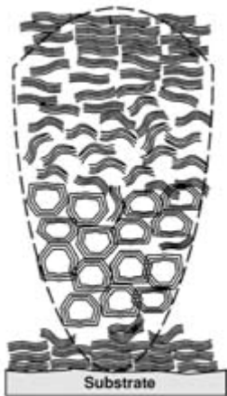
Figure 2: Variations of the microstructure in growth cones. Highly ordered layers at the top of the structure become more disordered closer to the carbon fiber (substrate) before resuming the highly ordered structure at the fiber surface.

orderly layered structure. These growth cones are a repeated structural phenomenon visible throughout the pyrolytic carbon. Pores, or voids, in the carbon-carbon composite are formed when small parts of the composite are sealed off before the gas has finished filling up all the spaces with Pyro-C. The pores have different shapes and comprise about 30% of the volume of the composite. (Fig. 3)