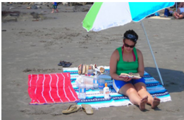
Going to the Beach

This card sort was key to my research project and would be used to gather information about how participants occupied their time. I would ask each volunteer participant to sort the cards into one of six categories of frequency of participation. Choices ranged from "Never Done and Don't Want To" to "Do Three Times a Week or More." This would show me the number, kinds and frequency of occupations in their occupational repertoire. Because the cards contained illegal occupations and activities such as drug use, each card was labeled on the back with a randomly assigned code. (Fig. 2)