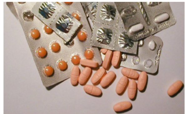
Misuse of Prescription Drugs (Ritalin, Adderall, Codeine, OxyContin, Percocet, Valium, Demerol, etc.)

In private, participants sorted them face down into the frequency categories. Only the codes on the backs of the cards were showing when I returned to record the results. In this manner I made an effort to protect confidentiality.