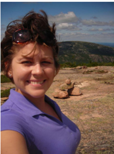
Fig. 3: The author in Acadia National Park

Once the card sort and data collection forms were ready, it was time for me to start recruiting and surveying participants. I began recruiting through people I knew. The process moved slowly at first, while I waited for emails and phone calls confirming appointments and willingness to participate. Eventually, this snow-ball sampling method paid off and recruitment picked up. In snow-ball, or convenience, sampling, you start surveying friends of friends and rely on referrals from initial participants to generate additional recruits. This method is used by many behavioral and social science researchers in pilot studies to get an inexpensive estimate of what further, more extensive research may show. I ended up traveling all around New Hampshire, Maine, and Massachusetts to survey people.