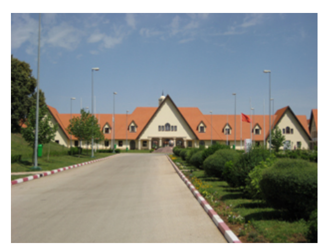
Al Akhawayn University in Ifrane

The Moroccan constitution, which outlines the country's political structure, was first adopted in 1962 and later ratified in 1970, 1972 and 1992. Each successive rendition of the Constitution reaffirmed the monarchy's preeminence and subordinate roles for the other branches of government (2). Article 1 states that Morocco "shall have a democratic, social and constitutional monarchy." Opponents of the monarchy feel this has not happened and, after the elections of 1993, refused to take part in the government.