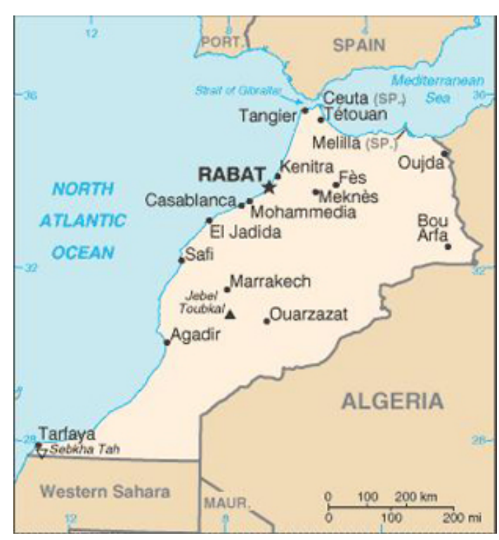
Morocco and its major cities

My interest in these questions was twofold: First, Americans take for granted the complexity of a functioning liberal democracy, so I wanted to look into the challenges that a country like Morocco faces, such as an undefined distinction between church and state and a weak separation between the branches of government. Second, I wanted to study the dynamics