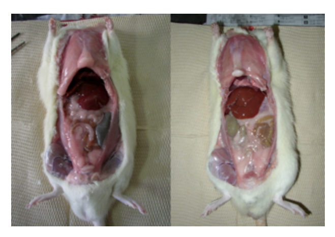
Organs of a young (left) and an old (right) rat. The organs of the old rat are enlarged with more fat around them.

It was tiring work. I remember the day we had to dissect sixty-five rats, then separate and label the different organs; it was a twelve-hour process. I was inspired, however, by the passion of my fellow researchers. Working with them brought me a step closer to being a scientist.