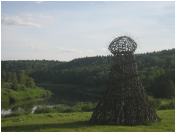
Maiak [Lighthouse], one of the pieces at the Arkhstoianie festival. Visitors to the site are welcome to climb the inside of the wooden structure.