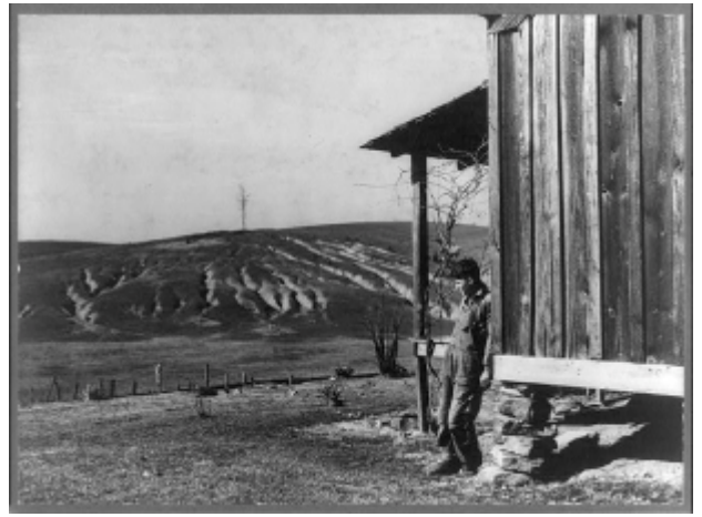
Eroded land on tenant's farm. Alabama, 1937.