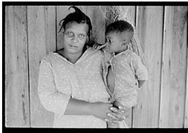
Ben Shahn. Mother and child. Arkansas, 1935.