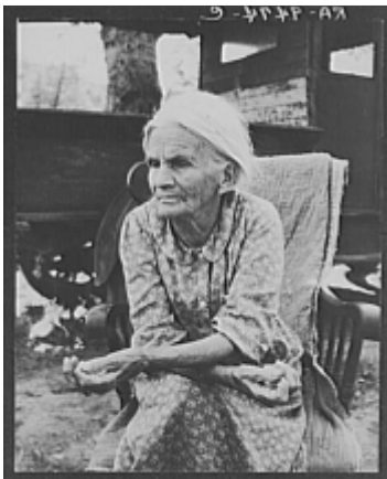
Dorothea Lange. Mother of family camped near a creek bed, panning for gold. California, 1935.