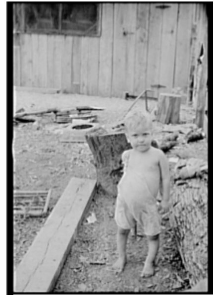
Arthur Rothstein. Sharecropper's child suffering from rickets and malnutrition. Arkansas, 1935.