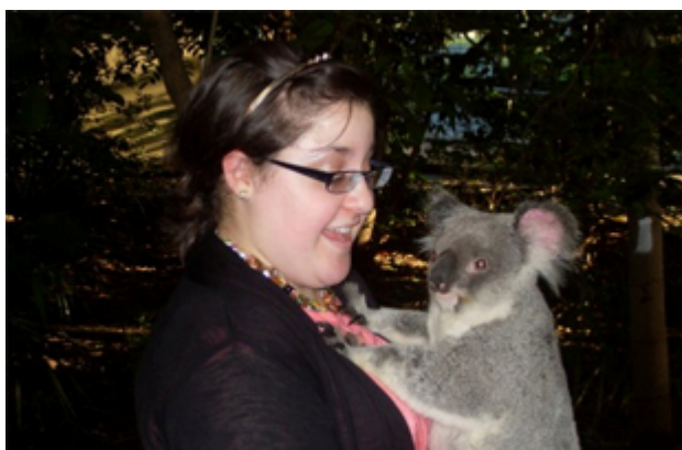
“Cuddling” with a koala at Lone Pine Koala Sanctuary

During weekend mini-vacations with friends from Walk On, a fellow IROP student, and my older brother, I met many of Australia’s famous animals. I came across a wild wallaby in the Glass Mountains, hand fed kangaroos at the Steve Irwin Australia Zoo, walked in a field of emus, saw some very large crocodiles in the Daintree River, and cuddled with a koala bear at a local reserve. Later, I was told that wild koalas, with their large black claws and territorial behavior, are not too cuddly in nature.