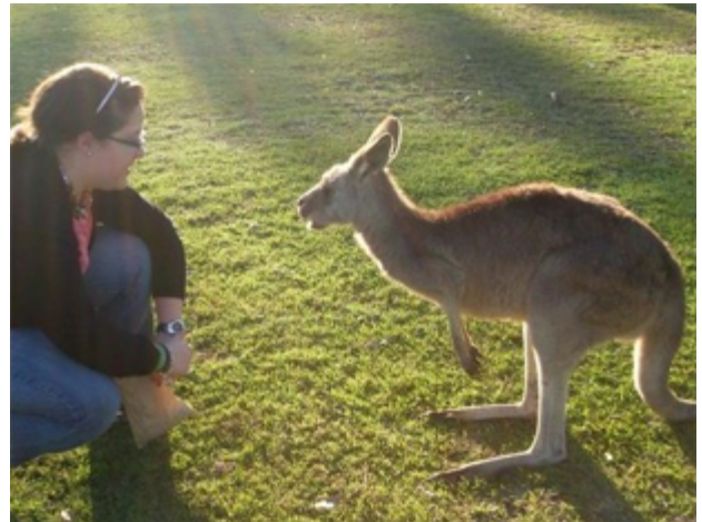
At the Lone Pine Koala Sanctuary near Brisbane, Australia

I wish I could complete this story by stating that my cousin proved his physicians wrong, but I can't. Today, he is at home in an electric-powered wheelchair after many months of traditional SCI rehabilitation and has regained little function since his accident. While he can still enjoy some things as an active outdoorsman, and is working towards moving from his electric-powered wheelchair to a manual wheelchair, he faces the many obstacles and frustrations that come with being one of the thousands of people in the United States who live with a spinal cord injury (1).