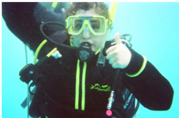
Scuba diving near Cairns in the Great Barrier Reef

As uplifting and inspiring as I found the Walk On clients to be, what struck me most about Australia was how the country as a whole seemed filled with optimistic and cheerful individuals. The bus drivers would more often than not greet me with a “Hello, love” or “Hello darling... how ya goin’ today?” At the park down the road, I would see huge gatherings of families and friends each weekend having an Aussie barbeque and playing a game of rugby, basketball, or soccer. I traveled north to the tropical city of Cairns to go scuba diving and snorkeling on the