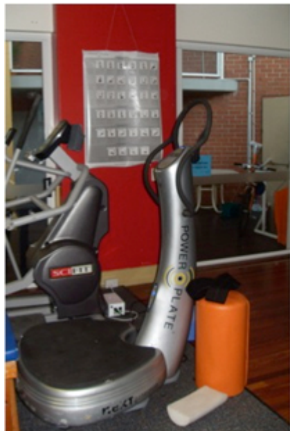
The Power Plate is a machine that creates multi-planar vibrations that cause and magnify muscle contraction. This is the machine that yielded the highest muscle activation.

To measure the electrical activity of the clients' calf muscles, I used a portable electromyography (EMG) unit. I did this by connecting two electrodes to the calf and recording the muscle activity while the client performed each of the three exercises: doing 90-degree squats on a Total Gym machine; pedaling on a recumbent bicycle with the resistance level set to "moderate"; and moving the clients' foot from the heel-down to toe-up position on a multi-planar vibration machine called a Power Plate. The Power Plate is an exercise machine that offers varying intensities of vibration movement to stimulate muscle activity.