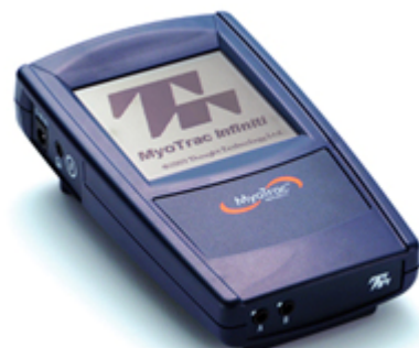
The Myotrac Ininiti Portable EMG Unit was used to measure calf muscle activity. (8)

My research subjects included nine men and one woman, aged sixteen to seventy-one, with varying levels of spinal cord injury. If the clients were capable of initiating some muscle movement on their own, they were asked to do so for each of the exercises. I recorded the clients' calf muscle activity during the first two weeks of my arrival, and once more within the final two weeks before my departure.