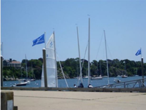
The sailboats used for the Shake-A-Leg program

While my cousin was in the hospital, I was in the midst of my athletic training curriculum at UNH. In the summer of 2008, I was hired to work for Shake-A-Leg, a program in Newport, Rhode Island, for people suffering from neurological injuries and disease, primarily SCI. There, clients receive advice on how to acquire a more independent lifestyle and can spend the summer sailing on specially equipped boats. (2).