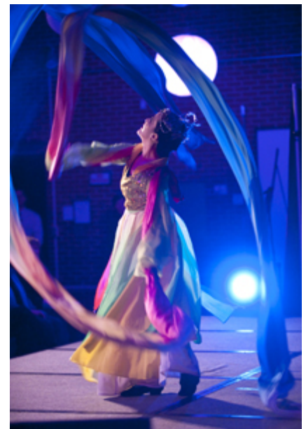
Dancers, musicians and other artists from Chengdu mesmerized crowds at the opening ceremony, October 26, 2010