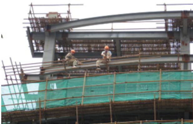
New supported by the old: in Shanghai, bamboo scaffolding is used for construction of modern high-rises

UNH undergraduates have already been doing research in China. During the past ten years alone, undergraduates have received grants from the University to study such subjects in China as prenatal care, the Chinese Communist takeover of Hong Kong, perceptions of nature and religious identity and mental illness.