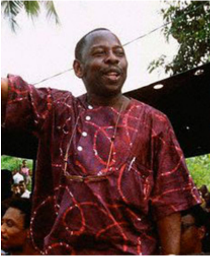
Ken Saro-Wiwa at a MOSOP gathering