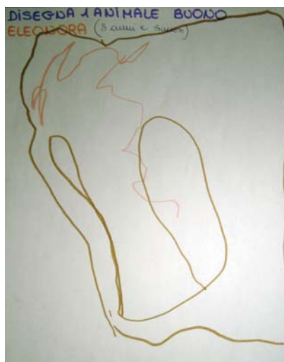
sketch 1: Cat with long whiskers

Eleonora (3 years and 5 months old), when asked to draw a good animal, chose a cat and drew it with an airy and spacious brown line, while imitating the cat's 'miaow'. When asked to explain what she had drawn, she pointed out the orange line similar to the long whiskers of a cat. After identifying a snake as a bad animal, she filled the sheet with jagged lines with acute angles characterized by rapid changes in directions.