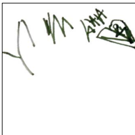
sketch 4: Animals that frighten me

In reference to the two sets of drawings discussed above, and also to all the productions analyzed, we can observe that the density of the lines on the sheet do not seem to be traceable to the classification of good or bad lines; the differences in density seen among the two drawings produced by each child, is not used in the identification of a specific emotional quality of the lines, though it appears to be used by the child as a distinctive criteria to differentiate the two kind of drawings, independently from their emotional quality.