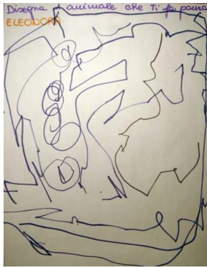
sketch 2: The bad snake

Valentina (2 years and 10 months) scribbled many coloured marks on the sheet, which she later identified to be animals she likes. (sketch 3). A great difference can be noted compared to that of the bad animal; in this case (sketch 4), there are no circles, but short lines, jagged and decisively more prominent. In the second drawing, Valentina specifies that she drew a monster on the left, a scratching cat in the centre and a shark on the right.