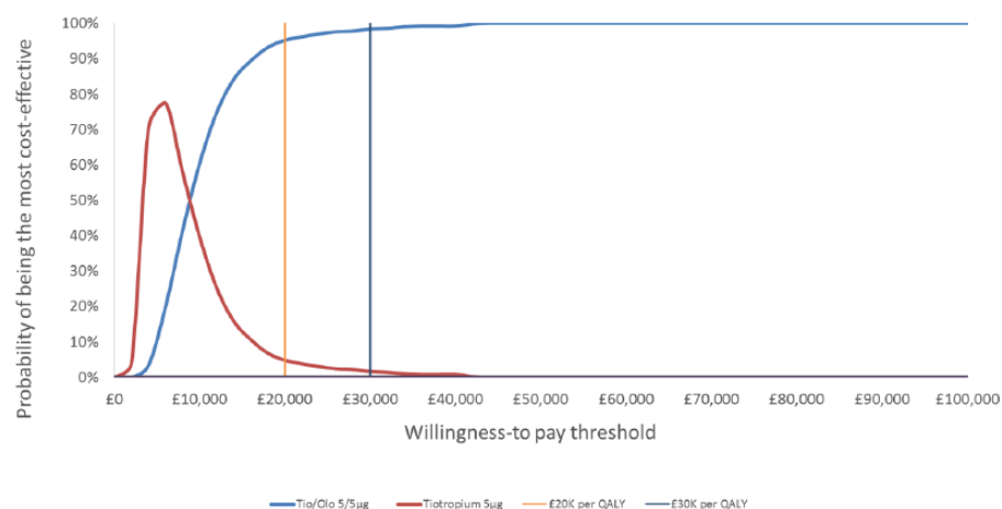
Figure 3. Cost-effectiveness acceptability curve. Olo, olodaterol; QALY, quality-adjusted life years; Tio, tiotropium.