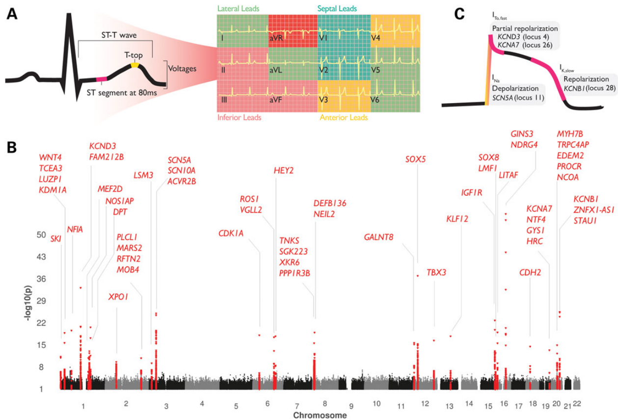
Figure 1. (A) We conducted genome-wide analyses of ST-segment amplitudes at 80 ms after J-point and T-wave (top) amplitudes reflecting temporal patterns in the cardiac cycle during the repolarization phase. In total, 12 phenotypes were defined by taking the sum of the ST-T-wave amplitudes in the lateral (I, aVL, V 5 and V 6 ), inferior (II, III and aVF), septal (V 1 and V 2 ), anterior (V 3 and V 4 ) leads and lead aVR. These lead groups cover the combination of leads with presumed anatomical meaning of the heart, and those that are used in the clinic for diagnosing Brugada syndrome (17) and ER (16–18). (B) Genome-wide association analyses of all ST-T wave traits identified 71 significant genotype–phenotype associations in 28 genetic loci (2 MB). The x-axis represents the chromosomal position for each SNP, which was assigned the lowest P-value across the 12 traits; the y-axis represents the -\log_{10} of the P-value for association. Twenty-seven loci were significant for ST-T-wave amplitudes. (C) Four genes overlapping four loci are directly involved in the cardiac action potential; SNPs near SCN5A were associated with ST-segment and T-top amplitudes whereas the loci containing potassium channel-coding genes KCND3, KCNA7 and KCNB1 were primarily associated with ST-segment amplitudes.

genome-wide significantly associated (Fig. 1B, Table 1 and Supplementary Material, Table S4 and Fig. S1).