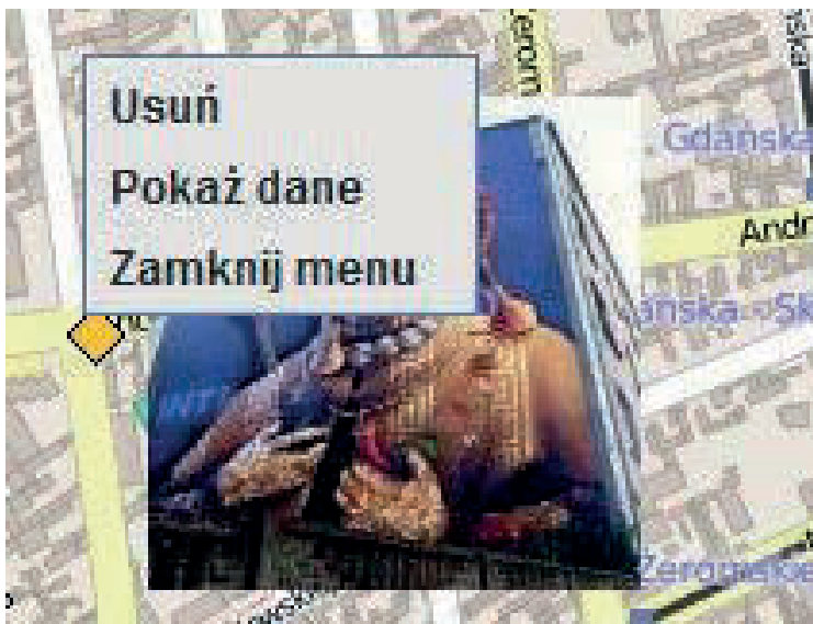
Fig. 3. Geoportals pop-up menu

In this phase, students implemented individual modules of the geoportals. The project included the following modules: