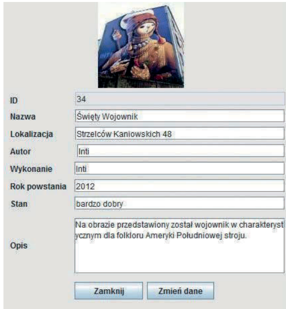
Fig. 4. Geoportal window displaying mural details