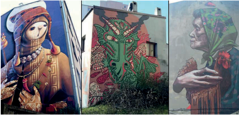
Fig. 1. Examples of photographs of murals taken by one of the project teams (from the left: the Holy Warrior, ul. 28 Pułku Strzelców Kaniowskich 48, the author: Inti; The Priest and the Devil, ul. Srebrzyńska 2, the author unknown, the Urban Forms Gallery al. Politechniki 16, authors: ETAM CREW)

ity of photographs, that were meant to show the painting in their entirety and in good lighting, according to the project description