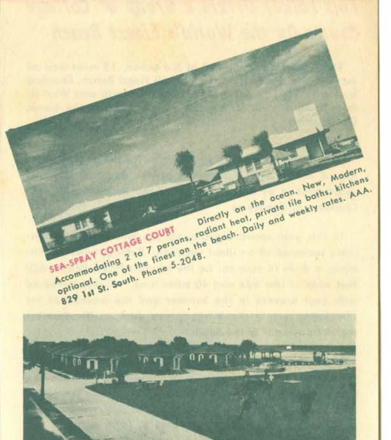
TOM THUMB COURT 1st St. & 22nd Ave. S. One full block on the ocean front. 17 Cottages, all private tile baths, one and two bedrooms, some with kitchen. Member AAA, Duncan Hines. T.V. in every room. Phone 5-4590.