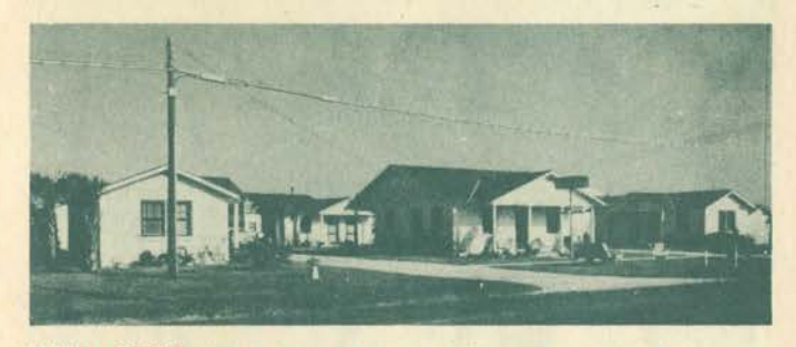
JANELL COURT Third St. (A1A) at 18th Ave. North, Jacksonville Beach. New - modern - conveniently located. AAA recommended. Phone 5-2261. P. O. Box 4.