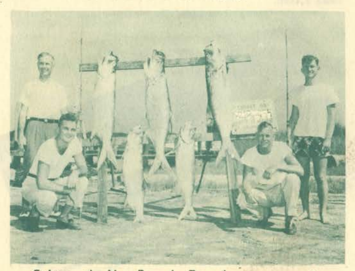
Fishing - the Year-Round - Pier, deep-sea, or surt

Fine restaurants, shopping centers, the boardwalk (center of amusements), excellent bowling alleys, and a modern theatre are conveniently located.