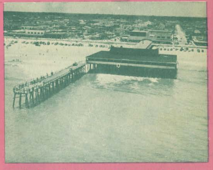
Jacksonville Beaches Cottage and Motor Court Association