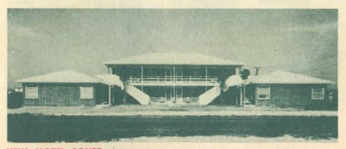
KEYS MOTEL COURT : 806 S. 3rd St. (A1A). Phone 5-4972. New modern - beautifully furnished units. Each with private tile bath and kitchen (optional). The key to comfort on beautyrest springs and mattresses. Write P. O. Box 366 for reservations.