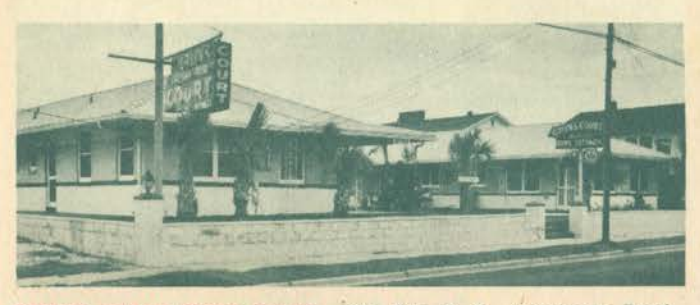
GREEN'S OCEAN FRONT COURT, 1 301 First St. S., Jacksonville Beach. 3 blocks from heart of town. All modern apts. and rooms with private tile baths. G. F. Green, Owner, Phone 5-3252.