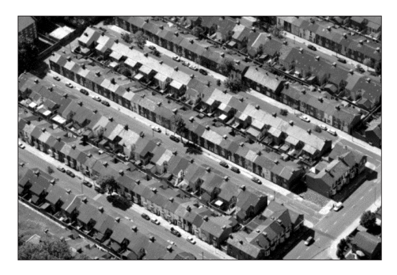
Fig. 4. Aerial View of part of the Welsh Streets Area, Liverpool

architect Richard Owens and constructed by Welsh builders (Carr, 2014) (Fig. 4). The area also contains the house in which the Beatles drummer Richard Starkey (Ringo Starr) was born in Madryn Street which is a stopping point for many tourist tours (Fig. 5).