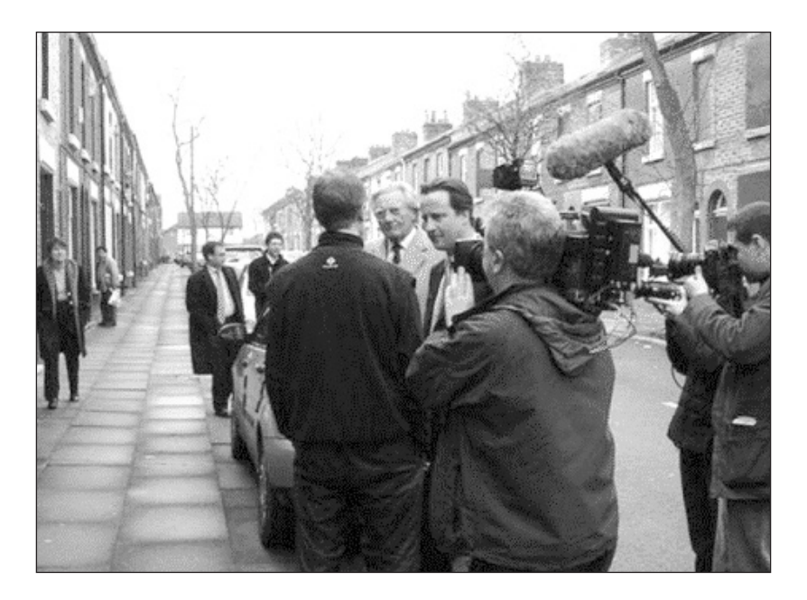
Fig. 7. Heritage Becomes Politicised: the (then) future UK Prime Minister visits the Welsh Streets in 2006

at the keystroke of a consultant's lap-top' (Brown, 2011, p. 1). Local residents' and heritage campaigners' representations by contrast presented such houses as being presently adequate, or potentially adaptable, to meeting ongoing housing needs and aspirations, and as being important witnesses to key moments in Britain's evolution into the first industrial state.