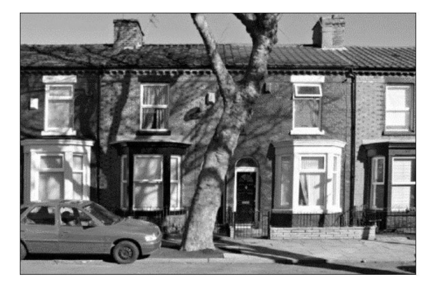
Fig. 6. Occupied housing in Voelas Street, Welsh Streets, in 2006