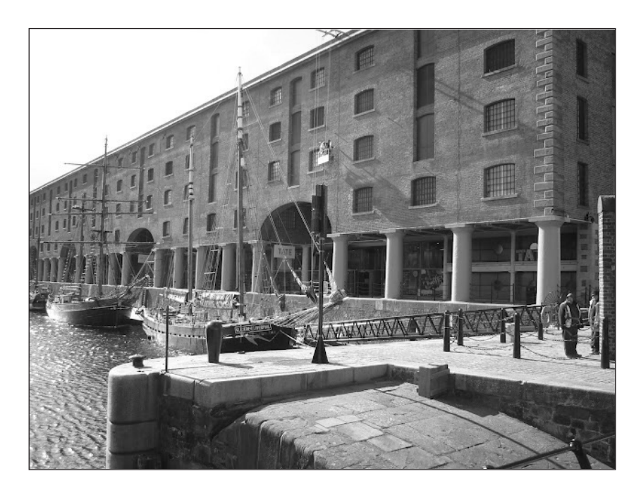
Fig. 2. The Restored Albert Dock, Liverpool Maritime Mercantile City World Heritage Site

In many ways Liverpool can thus be seen as an archetype of a post-industrial city which has sought to reinvent itself through the valorization of its heritage and cultural assets; an impression reinforced by its successful bid to become European Capital of Culture 2008 (Garcia et al. , 2010). An expansive view of heritage has been adopted by many policy makers which incorporates not just the tangible artifacts and built heritage of the city but also its diverse artistic, musical, sporting and community cultures. Yet as in many places, the relationship between regeneration and heritage has sometimes been problematic as well as symbiotic. The following accounts of two heritage-related 'planning episodes' (Healey, 2004) explore some of the issues which have been encountered around this relationship.