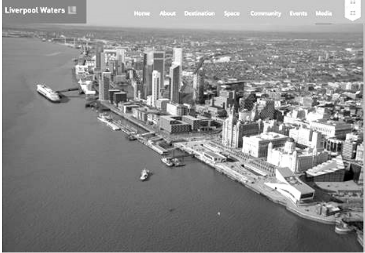
Fig. 3. Images of the proposed 'Liverpool Waters' development

The proposals are part of a wider vision for a development corridor between Liverpool and Manchester known as the Atlantic Gateway in which the company owns many assets. In 2013 the UK government confirmed that it would not 'callin' the Liverpool Waters application for scrutiny at the national level, leaving de-