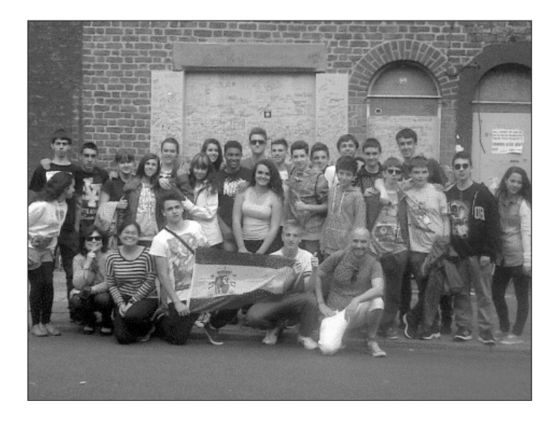
Fig. 5. Tourists Visiting the House where Richard Starkey ('Ringo Starr') was born in 1940