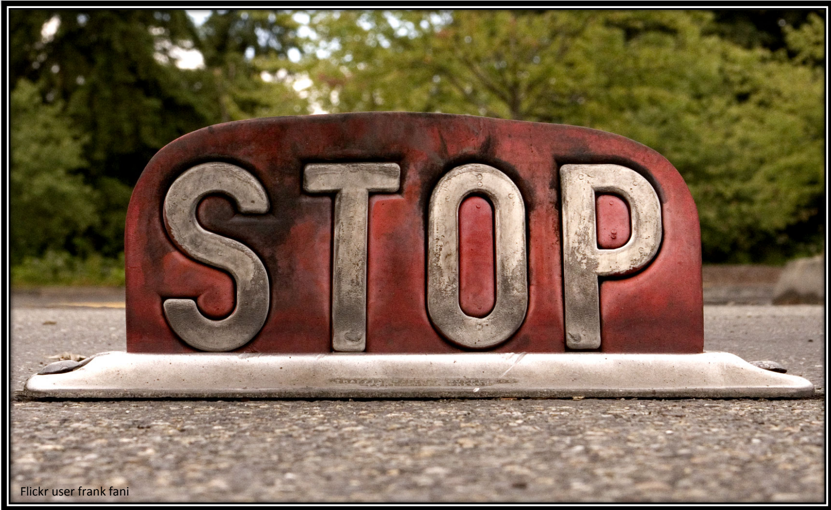
Flickr user frank fani