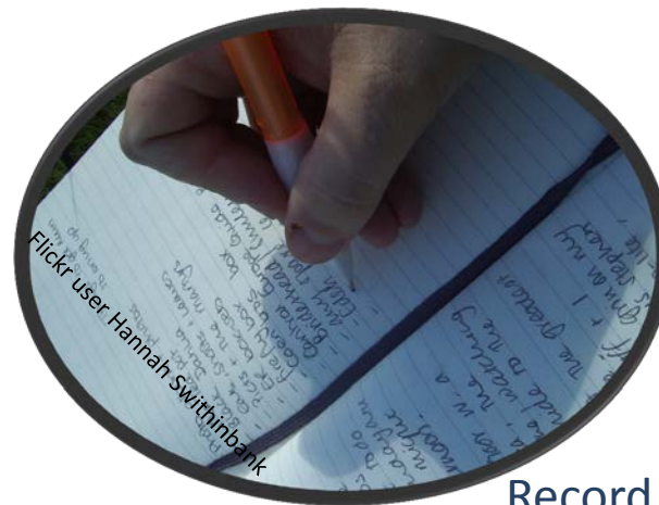
Record event logistics