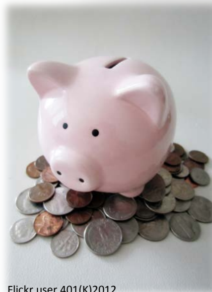
Flickr user 401(K)2012