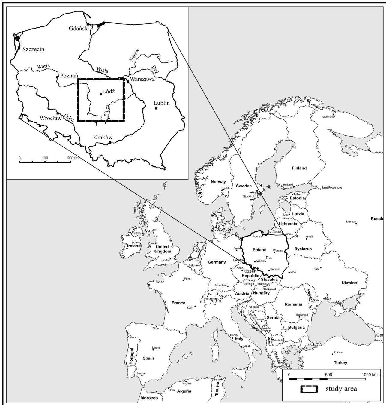
Fig. 1. Location of the analysed area with reference to Poland and Europe

Rys. 1. Północenie obszaru badań na tle Polski i Europy