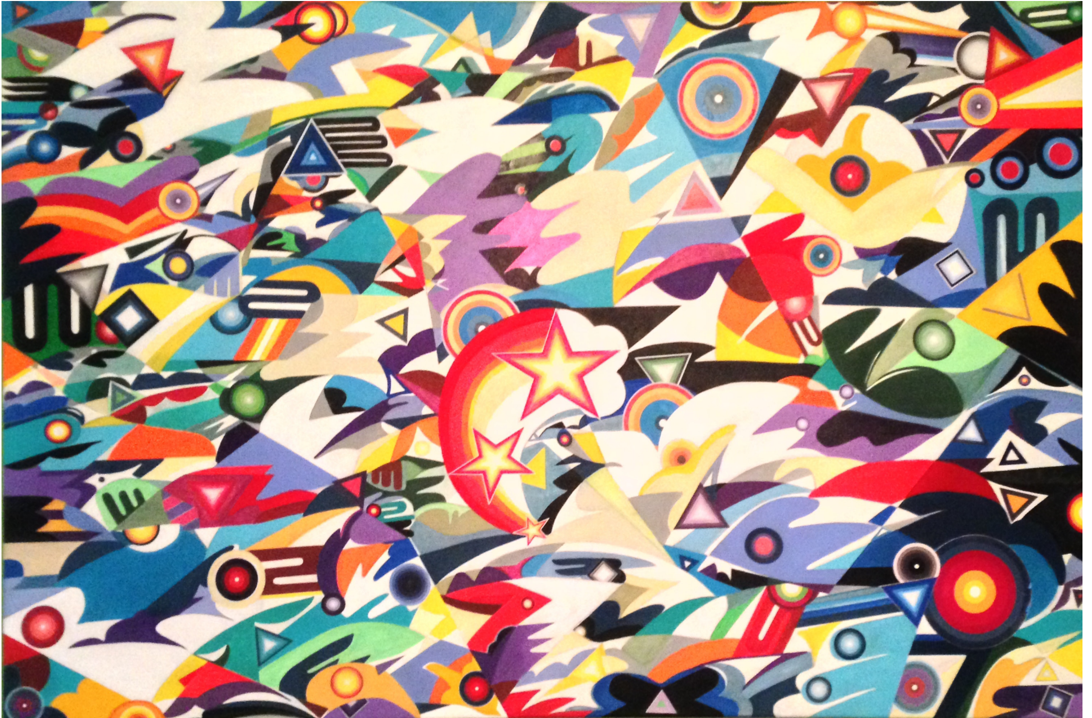
The Mural of Synthetic Maximalism