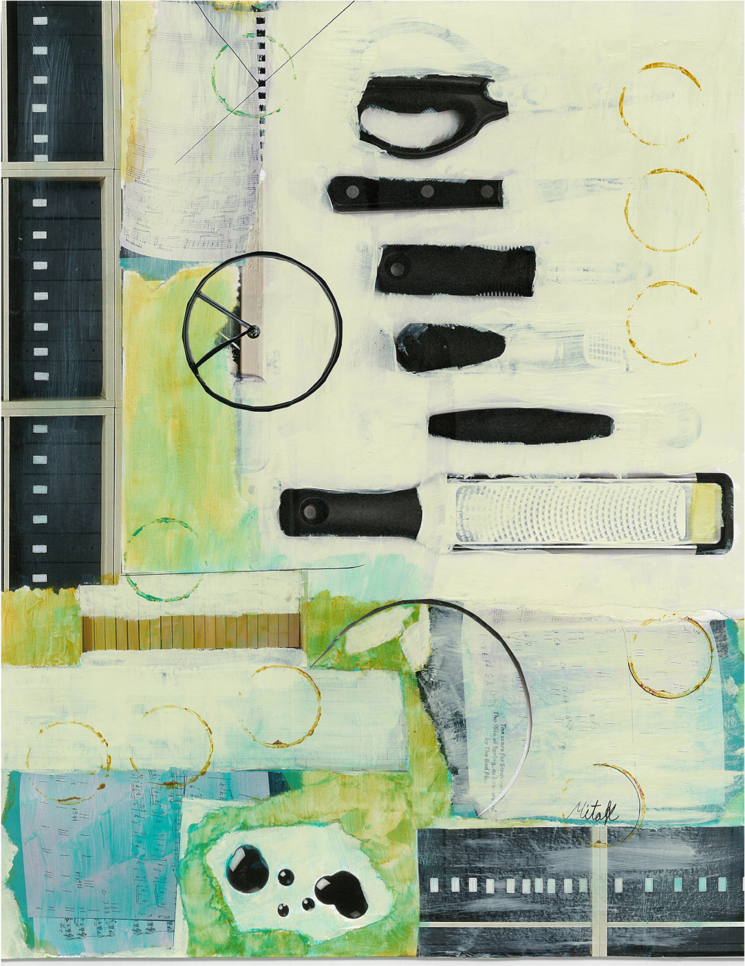
MICHAL (MITAK) MAHGERETEH Paper Collage