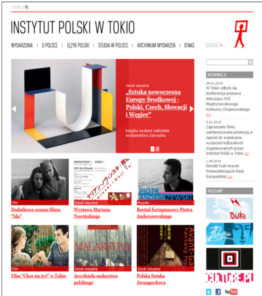
Fig. 3. The website of Polish Institute in Tokyo

Through the activity of 23 Polish Institutes in the world, as well as cultural sections of Polish Embassies, the Ministry of Foreign Affairs helps create the image of present-day Poland, including its culture, social and intellectual achievements of Poles, and contributes to the widespread popularization of the achievements of the Polish nation in the world. As already mentioned, in 2011 the first Polish Institute in Asia was established in Tokyo, largely thanks to the efforts of the then-Ambassador of Poland, the function of which was performed by the author of these words.