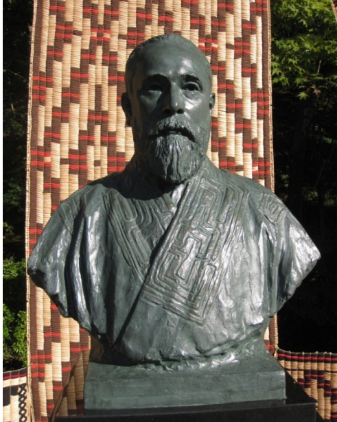
Fig. 2. The monument of Bronisław Piłsudski in Shiraoui

As a result of the long-term efforts of Japanese circles, Polish diplomatic services and the Department of Culture and National Heritage, a monument to Bronisław Piłsudski was erected. It was unveiled in Shiraoui, on the site of the Ainu Museum, and an international conference devoted to Bronisław Piłsudski was held at the University of Sapporo. This project was co-funded with the support of the Department of Cultural Heritage. In the unveiling ceremony, among others Minister Bogdan Zdrojewski took part.