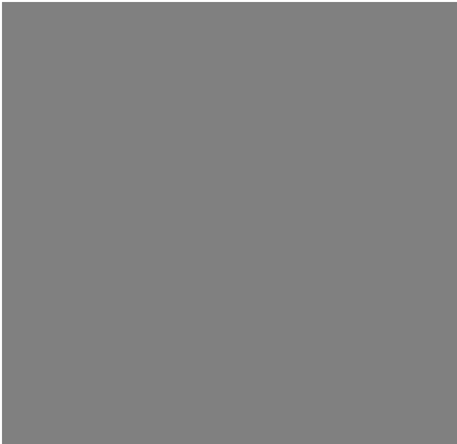
Figure 2. Vocabulary Terms