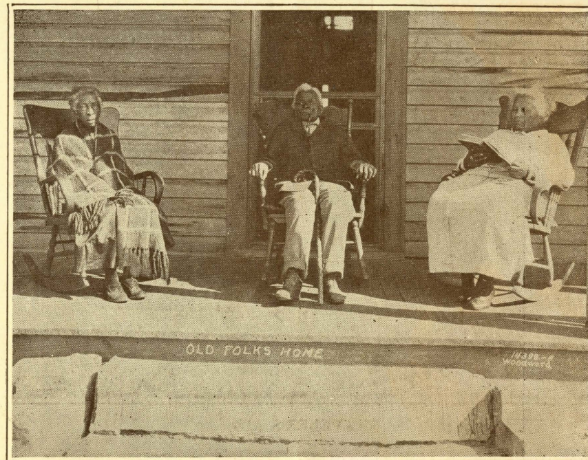
HOMÉ FOR THE AGED

of the financing of these agencies be given by the people for the benefit of whose race the fund has been established.